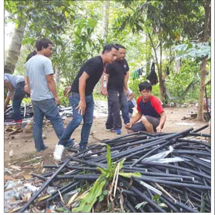
The suspects admitted to stealing wires and burning the sheaths to extract the copper inside.