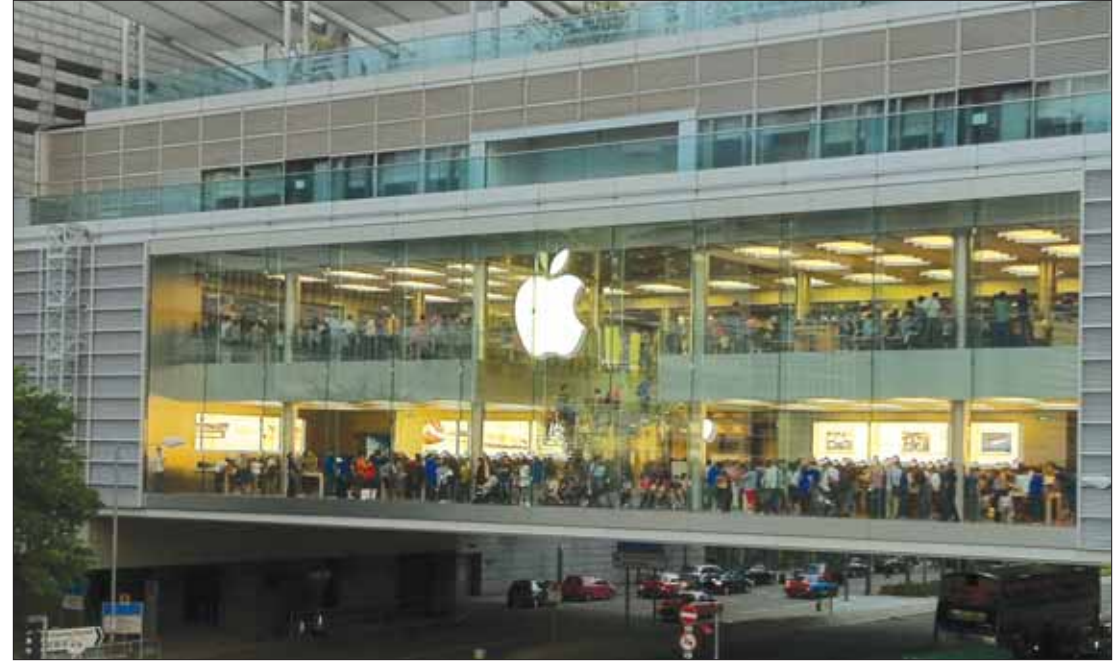
Looking at technical charts of leadership stocks such as Apple shows no evidence that the so-called 'smart money' investors are selling shares or taking profits off the table.

Track the iShares North American Tech-Software ETF (NYSEARCA: IGV) performance. This particular ETF focuses on a high growth sector and its performance gives us a better indicator about stocks