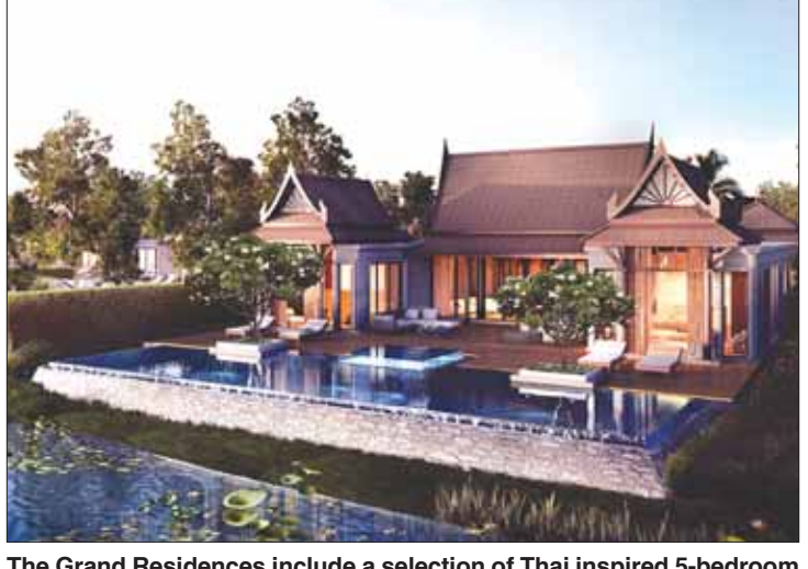
The Grand Residences include a selection of Thai inspired 5-bedroom villas in a gated estate near Bang Tao Beach.

Banyan Tree's global property portfolio, the Grand Residences include a selection of