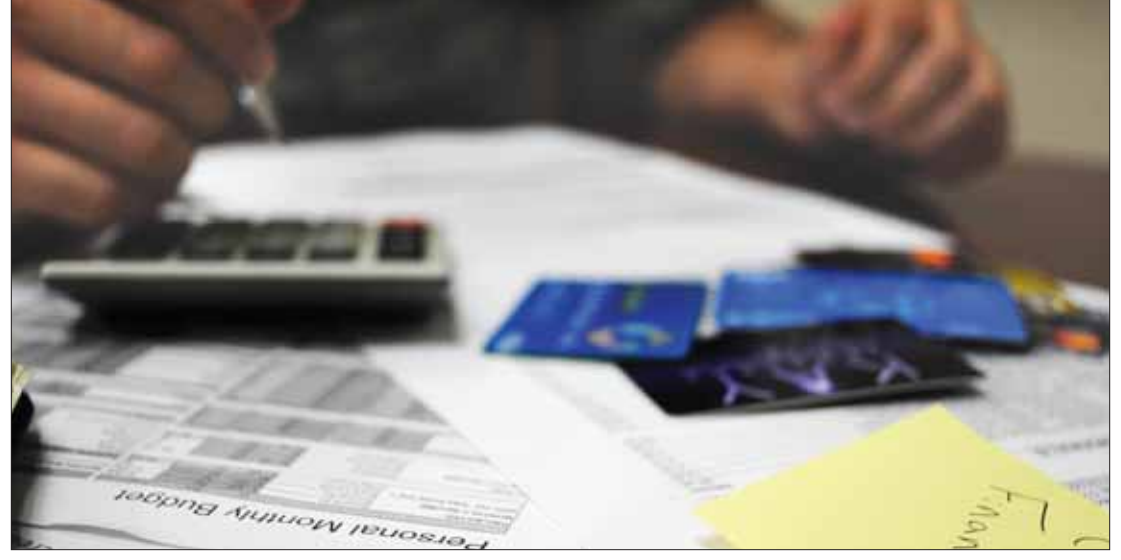
When collecting debt, it is important to ensure that it is enforceable.

The Thai Civil and Commercial Code covers multiple types of relationships. It is important to review the type