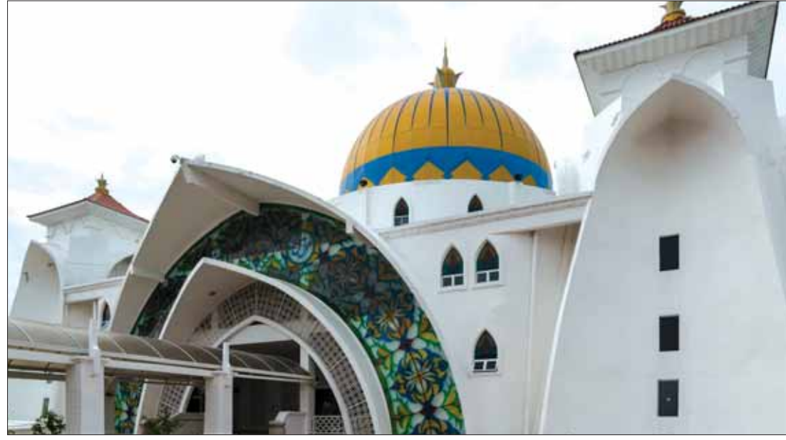
Predominantly Muslim Malacca embraced Islam during the 15th century.

In Patani, Muslim influence arrived when Muslim refugees from Pasai, fleeing religious persecution in Sumatra, settled in Patani. They began preaching Islam to the locals and later