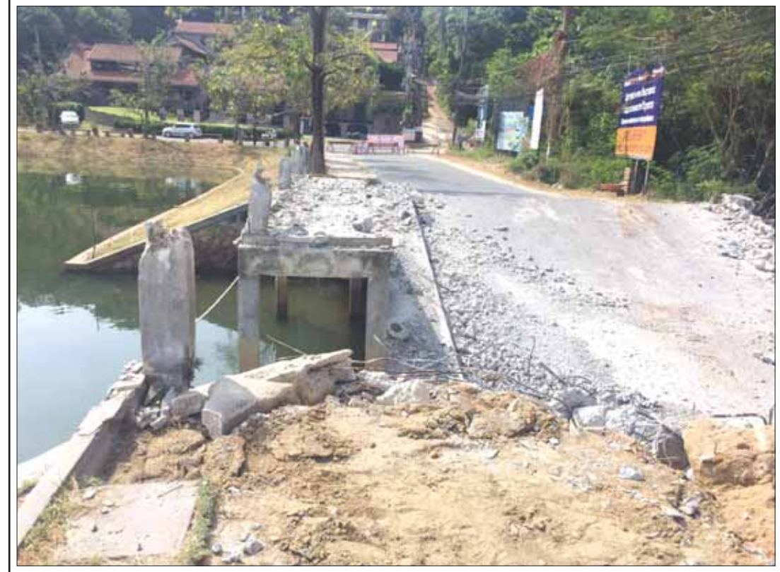
The bridge on the road around the Nai Harn lake in the area of Naiharn Beach collapsed earlier this week. It is now under construction, with the budget of 1.3 million baht, by Rawai Municipality. The project is expected to be completed in 2-3 months. During this time, authorities have asked commuters to use the diversion instead, signs for which were placed at the site in English and in Thai.

the scene to find the 3.5-meterhigh wall broken into pieces on the floor.