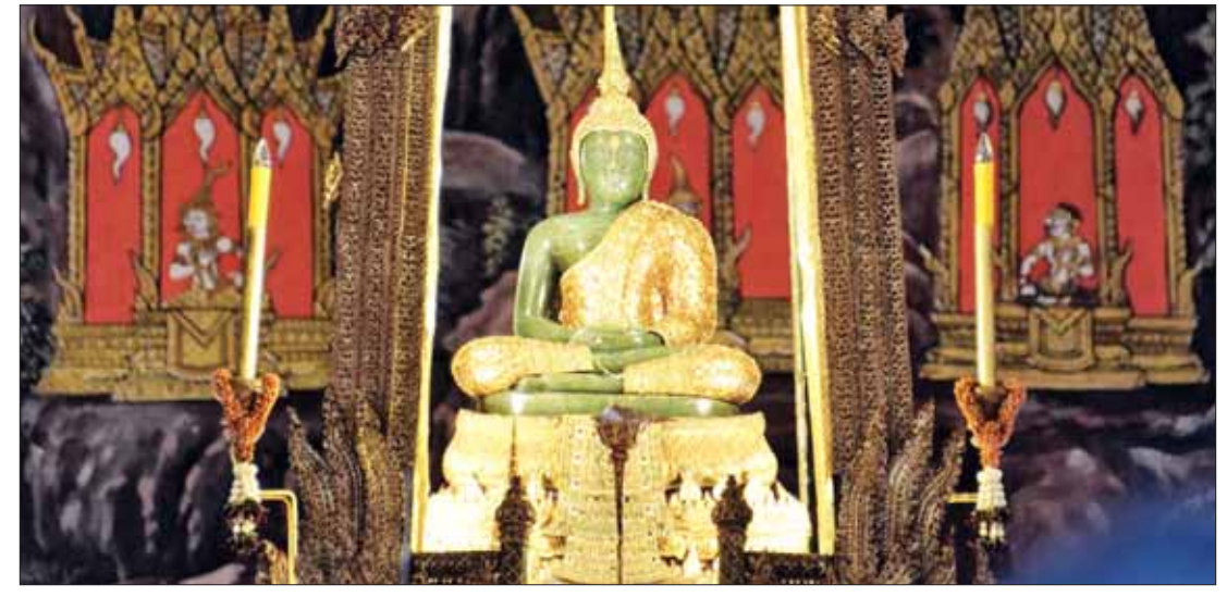
The Emerald Buddha figurine is housed inside Wat Phra Kaew in Bangkok.

He took the image out of the Chedi, began peeling off the stucco it was covered with, and found a beautiful emerald