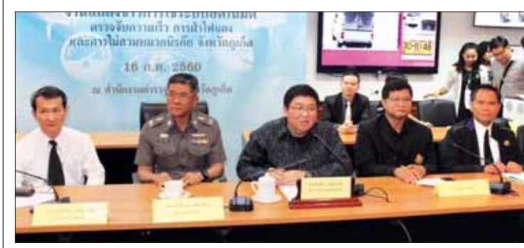
Gov Chokchai with officials at the meeting.

FIVE new high-tech 'red light cameras' were launched on February 16 in response to Phuket's recognition as one of the five most dangerous provinces for road travel in Thailand.