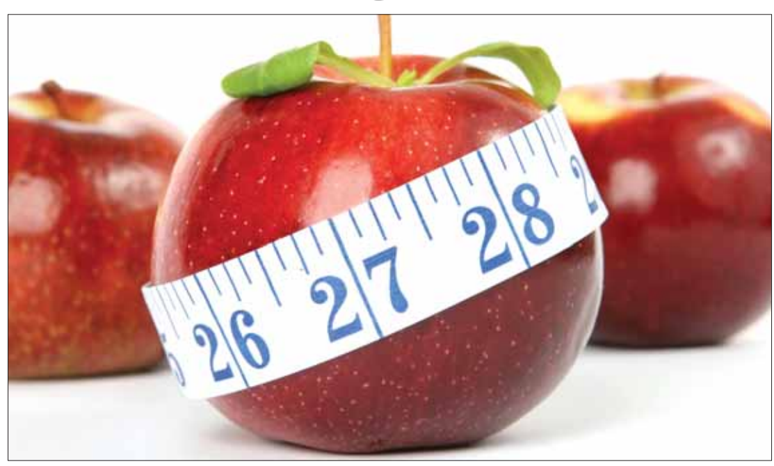
Weight loss is one of the benefits of consuming Apple Cider vinegar.

Hippocrates, the father of modern medicine, said, "All disease begins in the gut". Well, our gut needs acidity to function and acetic acid is a great source. What about all those who say alkalize or die? It's all about specifics. Too much alkalinity in the wrong places (like the gut) decreases digestion and the gut's ability to keep bad bugs down. However, too much acidity in the blood can lead to acidosis and tissue breakdown. This is why the gut loves acidity, but a healthy gut has buffers to handle the high acidity.