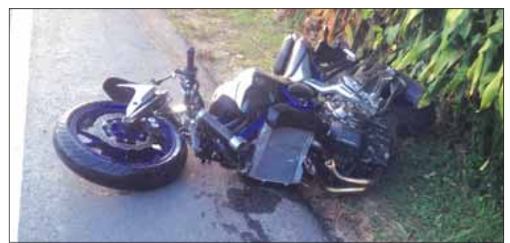
The owner of the big bike sustained minor injuries.

A THAI man was killed after a British man crashed into him in Thalang on February 20.