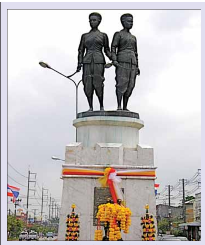
The Tourism Authority of Thailand is holding a festival from March 13-15 to commemorate Thao Thepkrasattri and Thao Srisunthorn for protecting Phuket from being attacked by the Burmese. The festival will include performances about historical events, booths selling local products and local foods.