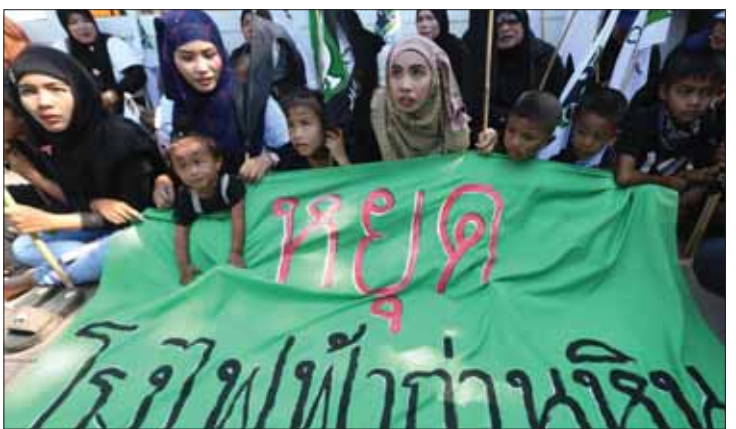
Protestors outside the Government House.

"It will affect tourism for sure. Tourists come to Krabi to breathe fresh air and see unspoiled natural beauty – not to breathe in black smoke and ruin their health. Electricity Generating Authority of Thailand representatives said they will help those who live within a five-kilometer radius, but what