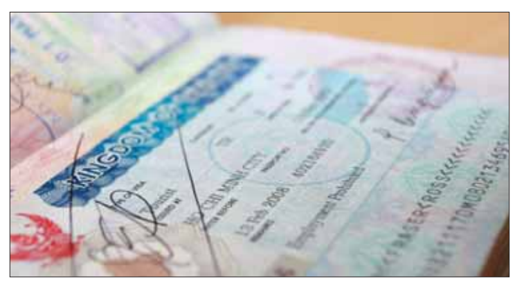
Air or sea tourists can enjoy visa-free trips.

Officials say they hope that extending the fee waiver will give Thailand's tourism industry a boost as it heads into what is traditionally a low season.