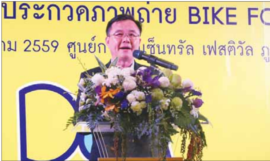
Phuket Vice Governor Kajonkiet Rakpanitmanee.

The Tourism Authority of Thailand (TAT) Phuket Office exhibited winning entries for the recent 'Bike for DAD' photo competition. Some 1,009 photographs were selected out of more than 9,000 snaps, selfies and captures sent in by the public from January 21 through January 24 at the lifestyle mall.