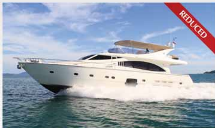
Ferretti 731 – 2006