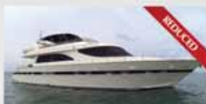
Dragos 24 m (2006)