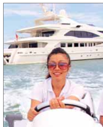
Drive me tenderly.