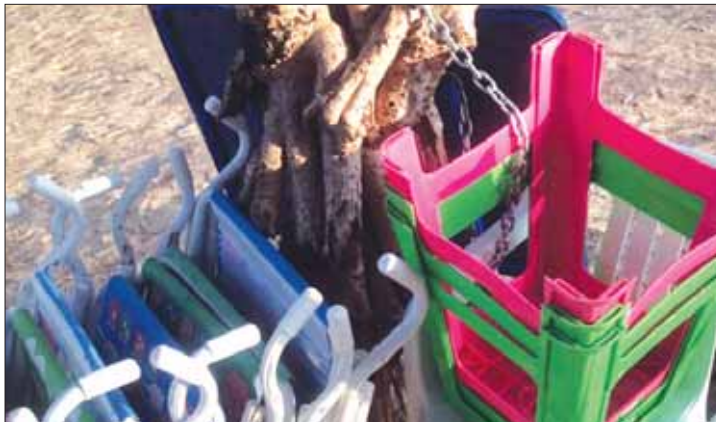
Beach chairs are being locked to nearby trees.

V/Gov Chokdee noted that it is up to local municipalities to monitor beaches and vendors in their jurisdictions to ensure that they are adhering