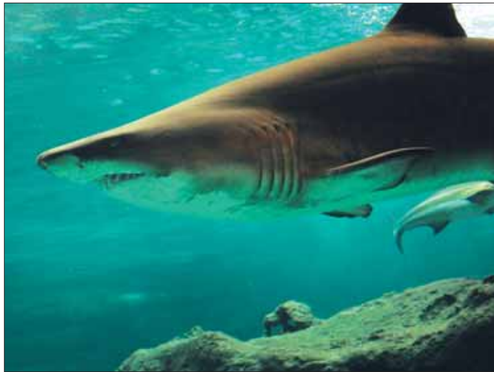
Sharks have been around much longer than dinosaurs.

land, have seen dramatic declines in shark populations due to market demands for shark fin soup, and as a result of oceanic pollution. Sightings of Phuket's harmless local Leopard Shark have declined over the last five years, from a few each month to less than one every two