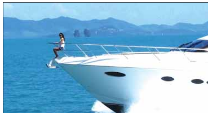
Phuket is every yachties' dream destination.

Overall we are confident that the Thailand Yacht Show will be the first of many bigger and better yacht shows in the future and will help put Phuket and the region on the map as a world-class yachting and leisure destination.