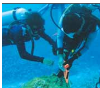
Diving continues in Phi Phi.

"However, I must still submit a proposal for official approval to the Department of National