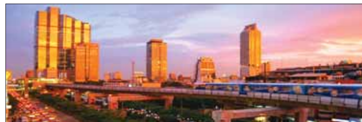
BTS Group Holdings and Sansiri recently joined forces to snap up 40 rai of prime real estate worth 7 billion baht.

This month's deal is for 700 rai near Krunghthep Kreetha Road, owned by Bangkok Land, which is negotiating for a sale