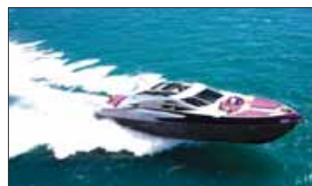
Numarine 78 Hardtop with three en-suite cabins and a loft-style saloon comes only in purple.