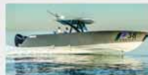
Premier 38 (2013)