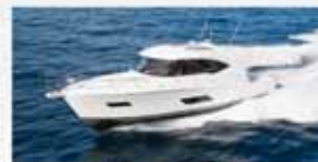
Riviera 525 SUV