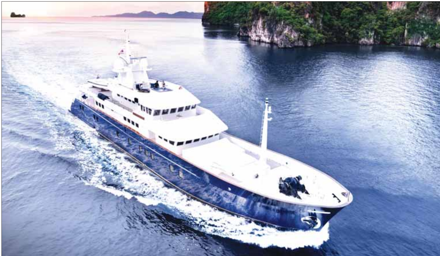
The 50-meter M/Y Northern Sun will be one of at least 14 superyachts taking part in the Thailand Yacht Show.