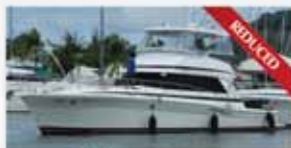
Riviera 48 (2000)