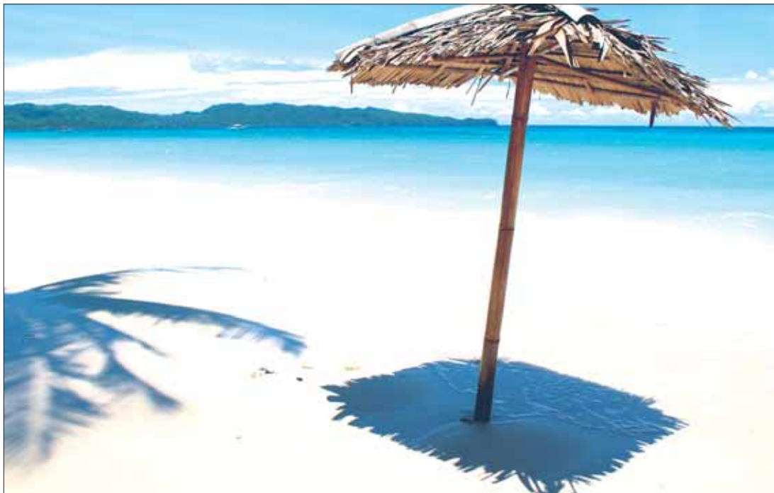
While Bali and Phuket continue to spar in the global tourism wars, Boracay keeps ranking as one of the best beaches anywhere.

Over time the domino effect had real estate buyers wanting to either bring their own mega yachts to Phuket, or else go out and purchase a new one. Bring on Aman Cruises, where hotel