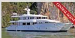
Incat Crowther 35m (2012)