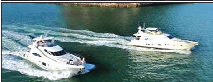
Guests can enjoy dancing to the tunes of DJ Romain, while perusing luxurious yachts at Ao Po marina.

ANDAMAN Cruises will be hosting its 'Blue Party' just in time for the launch of the Thailand Yacht Show.