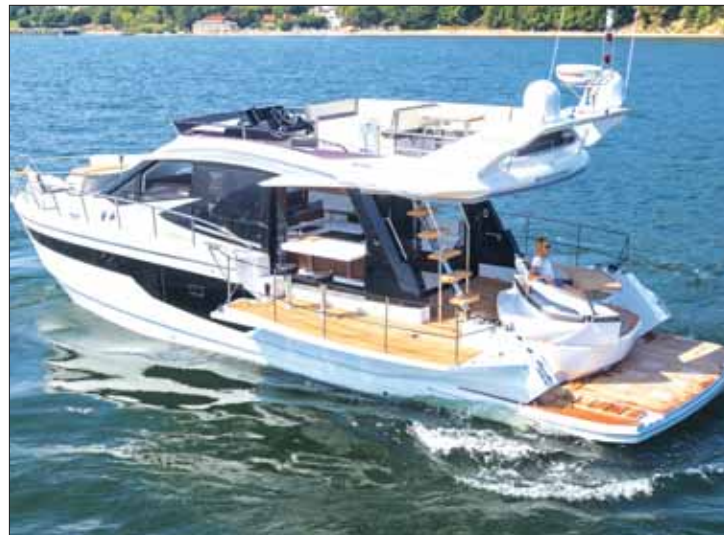
The Galeon 500 leisure cruiser has a unique beach mode feature, extending the cockpit to six meters by dropping down both the port and starboard sides.

The luxury leisure craft designed for cruising tropical waters features a unique 'beach mode' function, which extends the width of the cockpit to six meters by dropping down both