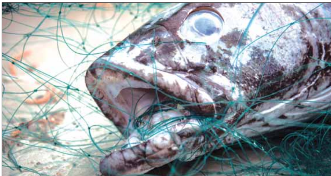
The fish is primarily eaten by diners in the United States and Europe.

servation of Antarctic Marine Living Resources (CCAMLR) has set an annual quota of just under 25,000 tons of toothfish caught per year. However, illegal, unreported and unregulated (IUU) poachers targeting the species are doing incalculable damage to the populations as they attempt to meet market demands.