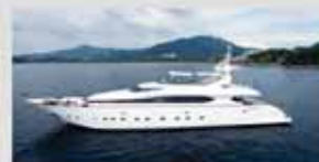
Maiera 31 DP (2006)