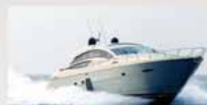
Pershing 72 (2009)