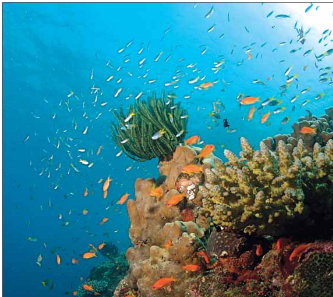
The Andaman Sea has about 280 varieties of fish as well as numerous benthic organisms.

Of course, and as any yachtsman can testify, the is-