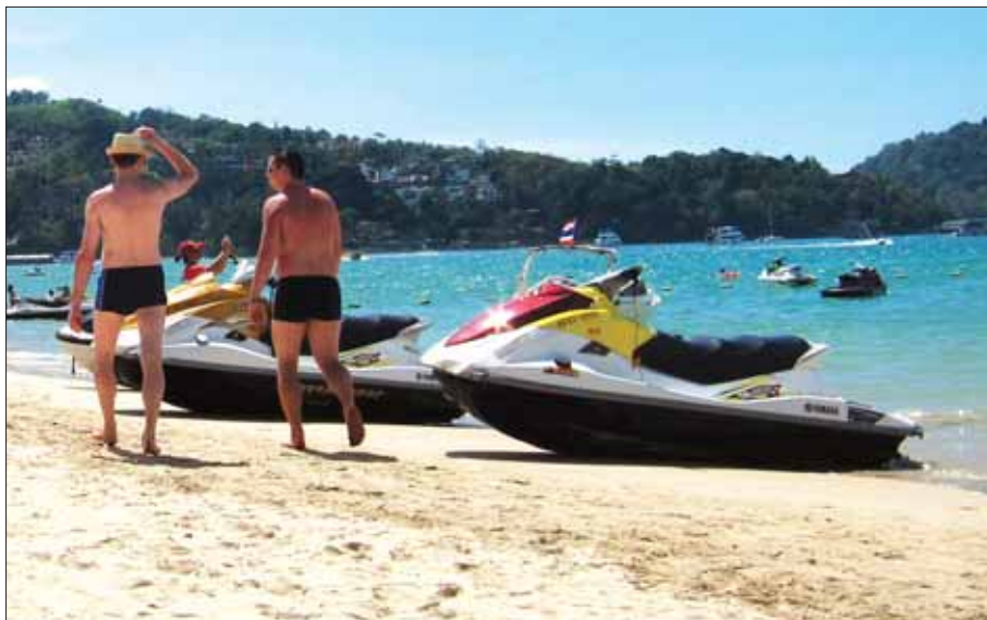
Marine vehicle zones seem to dominate Patong Beach.

All the resorts were separated from the beach by a sand or dirt path. During the day, on the beach side of this path there were temporary stalls selling everything from textiles, trinkets, knick-knacks, drinks and snacks.