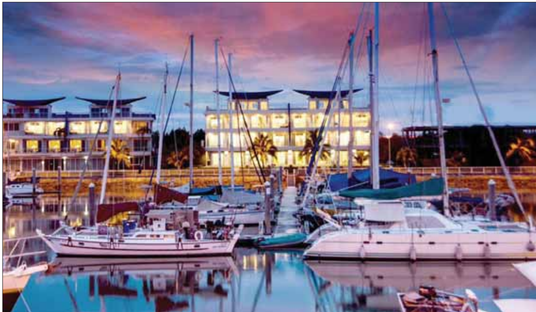
The government is looking to support the development of marinas along Thailand's more than 3,000km of coastline, including the coasts of Krabi and Phuket.

"Krabi Boat Lagoon is located in a natural mangrove area, easily reached by a 15-minute drive from Krabi International Airport, about two hours by car from Phuket International Airport or just