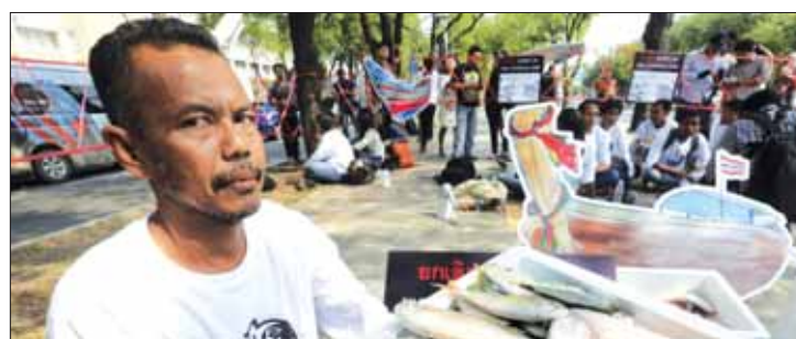
Local fishermen protest against Article 34.