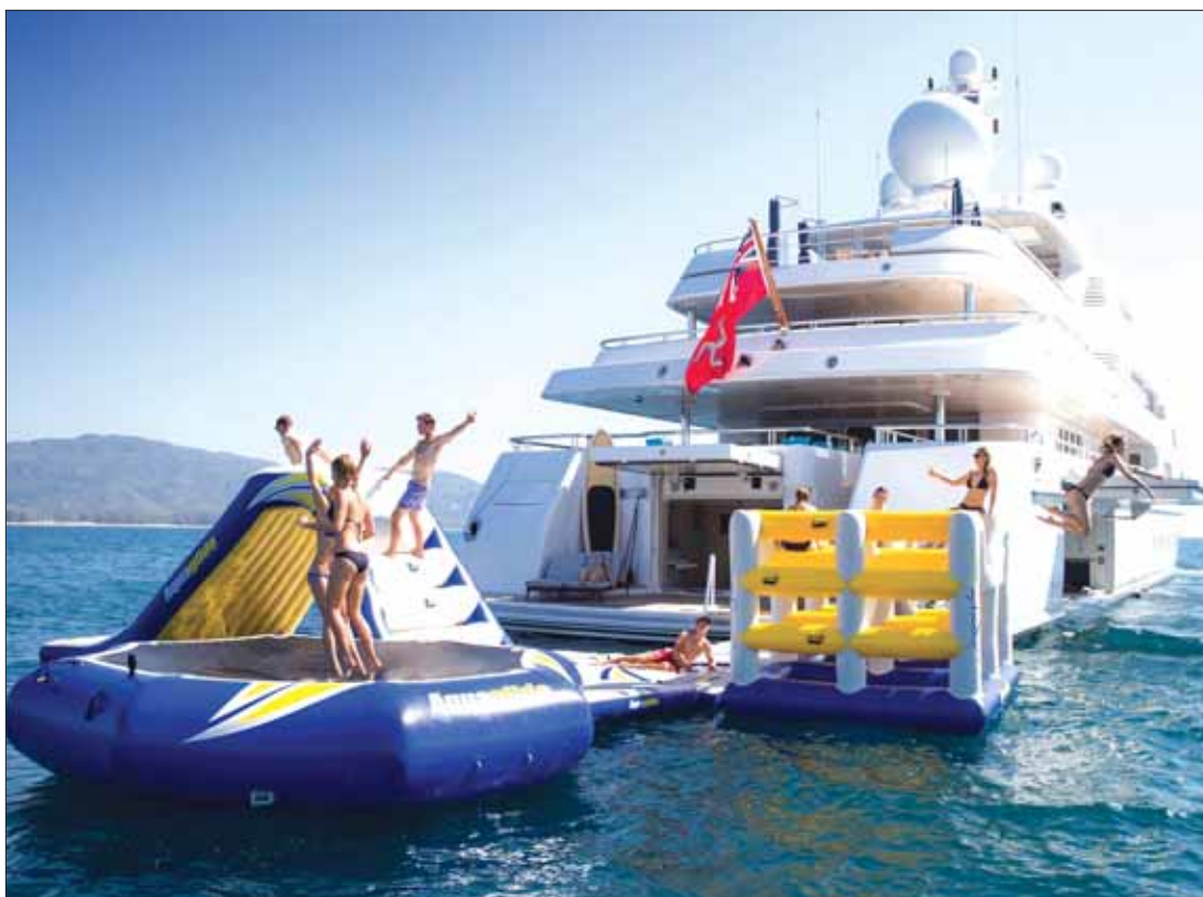
Thailand sees economic potential in better catering for the 'toys' of the wealthy.

The push to develop the marine tourism industry in Thailand comes directly from the Prime Minister, explained