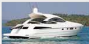
Pershing 46 (2010)