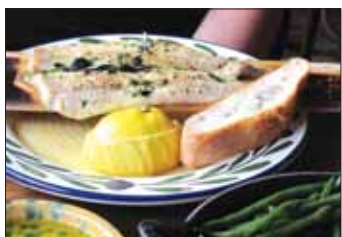
Toothfish is commonly called Chilean Sea Bass.