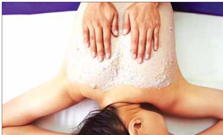
Chose from four signature wellbeing treatments.