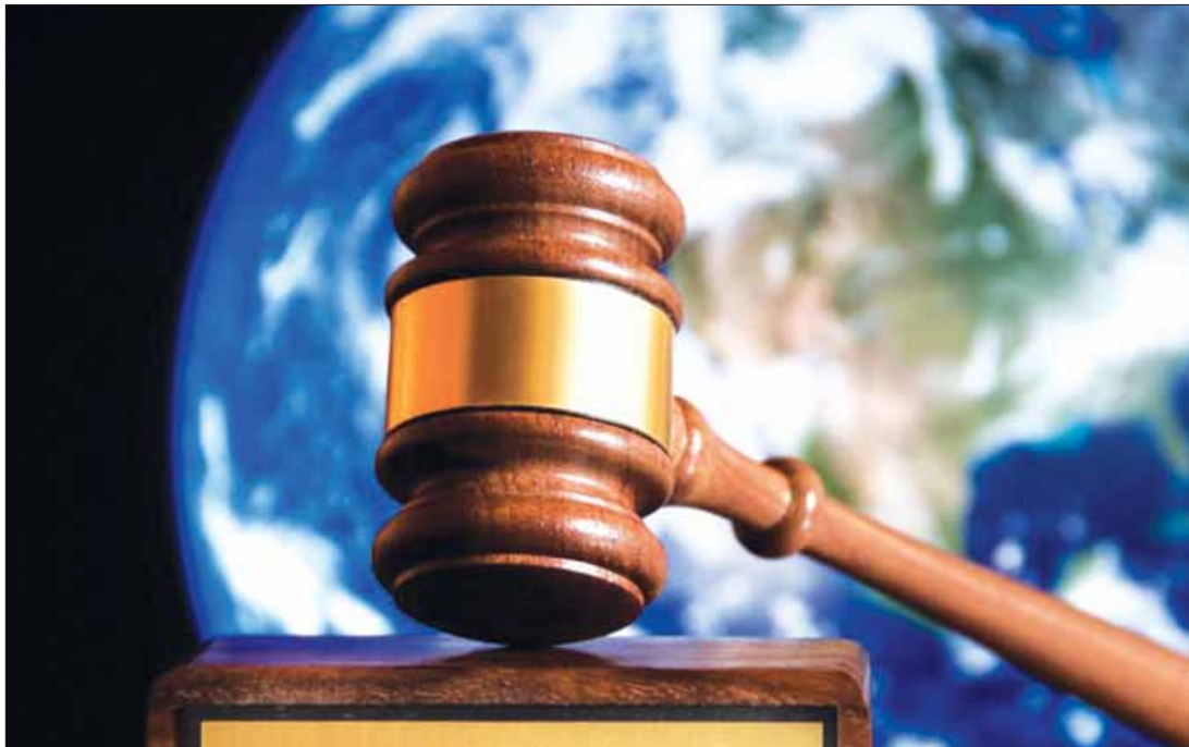
Foreigners should know condominium laws in Thailand before committing to buying.

Most of my clients over the years have bought their condominiums outright with cash from overseas, or had the cash in Thailand and due to the quirky rules on ensuring you have a 'Foreign Exchange Transaction Form' had to move monies out and then move monies back into Thailand again with the bank fees and potential foreign exchange