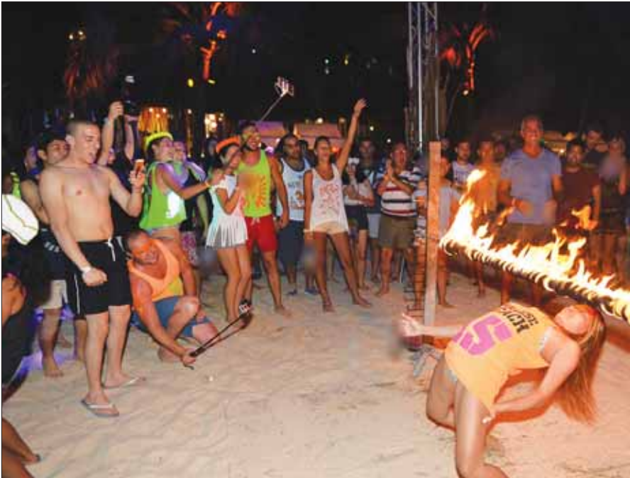
Fiery fun was had on the sand at Paradise Beach Club's full moon party last week.

The full moon party Spin on Paradise was a fiery affair at Paradise Beach Phuket, near Patong Beach. A gang of the island's top DJs turned up the heat with their beats, including DJ VaiShiYas from Spin Twist Records and DJ Bassforscher.