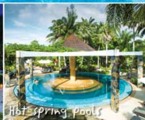
Hot spring pools