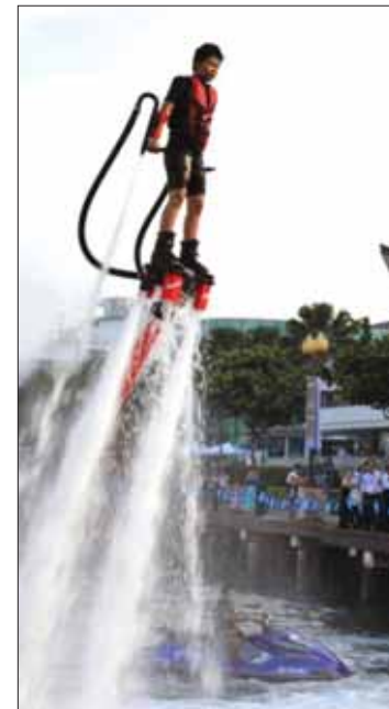
Aquatic action includes daily jet-surfing, jet-skiing and paddle-boarding shows at the Demo Platform.

See the social calendar online for more details at www.thailandyachtshow.com/show/programme . To register online as a visitor visit www.thailandyachtshow.com/tickets .