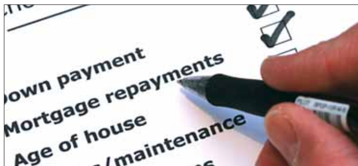
The packages will aid low-to-middle income earners.

Applications for the packages will be taken until March 31 and borrowing must be completed by April 29.