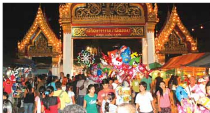
Family fun, games and food at Chalong Temple.

It’s that time of year again. Phuket’s biggest annual temple fair, held at Wat Chalong, will kick off on February 7 to offer one week of local fare and entertainment.