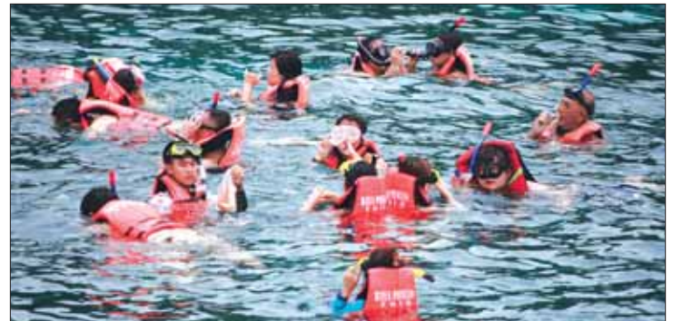
Tourists should be taught the basics of snorkelling by trained instructors before going into the water.

Together we can make Phuket a unique and appealing place for tourists and a World Heritage Site for future generations.