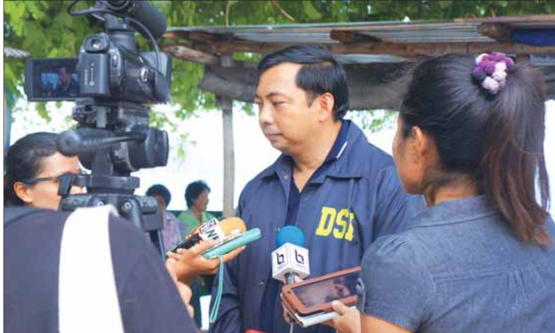
Lt Col Prawut alleged that a flying SorKor 1 was used to obtain national park land.

bring in further documentation to clarify the situation," said Col Prawut.