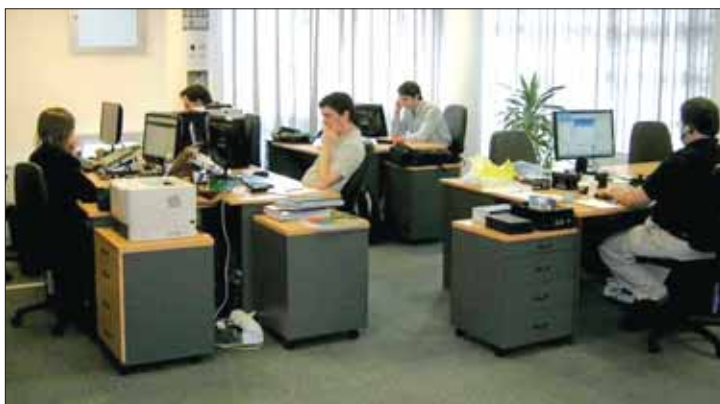
Open office layouts are preferred by e-commerce businesses, making new facilities highly sought after.

The four key characteristics e-commerce businesses look for in an office building is location, quality, efficiency and lifestyle, whichever location they choose, access to mass transit is a mandatory requirement.