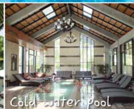
Cold water pool

OUR FACILITIES INCLUDE FULL BEACH RESORT, 2 RESTAURANTS, 2 HOT SPRING POOLS, COLD WATER POOL, EXPANSIVE SWIMMING POOL, GORGEOUS PRIVATE BEACH, FULL SERVICE SPA, FITNESS ROOM.