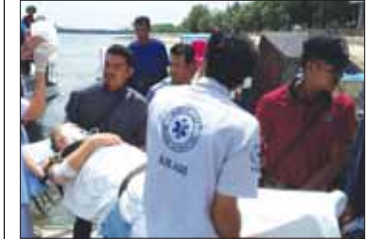
The divers were transferred to Krabi Hospital.

A RUSSIAN diver lost his leg and another diver was seriously injured after being hit by a speedboat near Maya Bay on Wednesday.