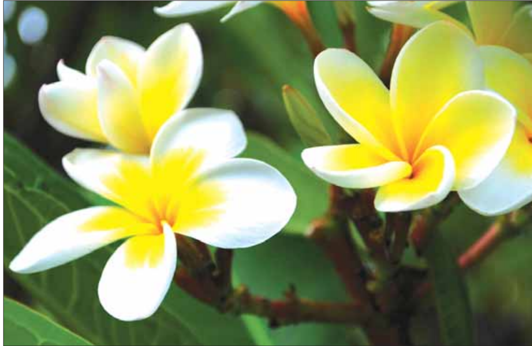
Leelawadee is the Thai name for the plumeria, also known as frangipani.

Nowadays, the Thai name for the plumeria is leelawadee , a graceful and upbeat name that