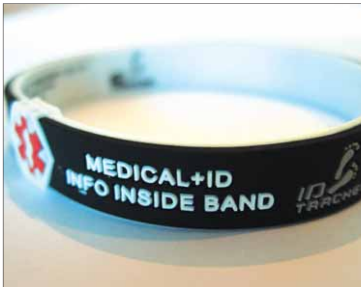
The band allows quick identification of the owner.