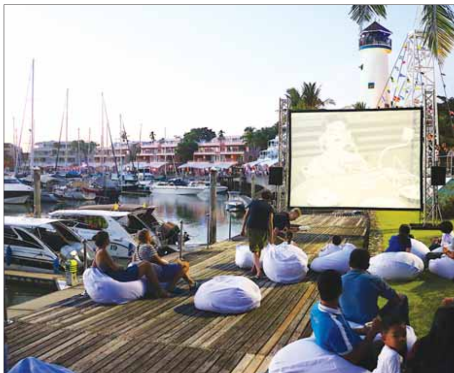
An outdoor movie theatre was one of the new attractions at the popular weekend market.

Families and friends flocked to the first Phuket Boat Lagoon Lighthouse Market of the year last weekend. Visitors enjoyed new attractions at the dockside market, including an outdoor theatre, fireworks and of course lots of fun food.