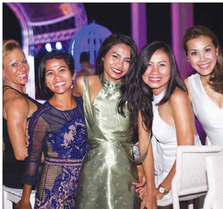
Glamorous guests gleam and beam at Xana Beach Club's Volume 3 Full Moon Party.

Back by popular demand, Xana Beach Club with Attica hosted its Full Moon Party – Volume 3 on January 22 for the island's night owls and fans of glam, who were treated to Live DJ vibes, stage performances and fire spinning.