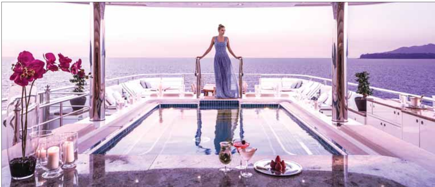
Get a taste of the uber luxury on board the 73-meter pleasure cruiser for charter, Titania.

The futuristic 41-m superyacht designed by Norman Foster is a