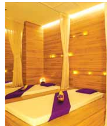
Serene surroundings at Ryn Spa

Ryn Spa provides numerous other services including foot reflexology, body exfoliation, scalp massage and various facial treatments. You can also take the Ryn experience back home with you by trying out their range of oils and lotions including anti-aging, skin uplifting, moisturizing and purifying. And if you’re celebrating Valentine’s Day in