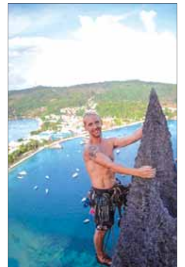
From the top.