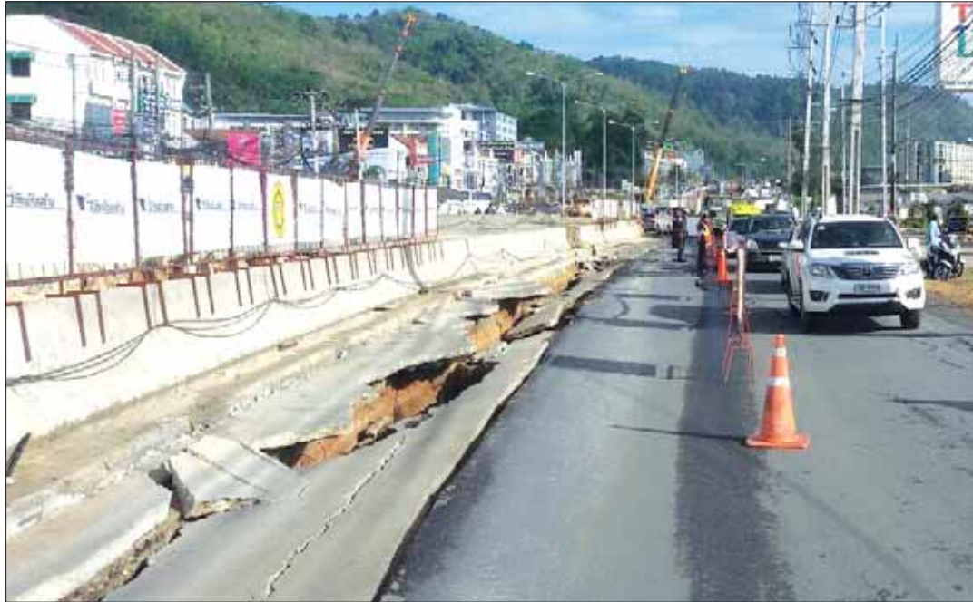
Heavy rains on January 28 left sections of the road running alongside the Samkong Underpass, as well as one of the underpass walls, heavily damaged. The severely damaged sections, which have already been repaired, have had no effect on underpass construction, confirmed a Phuket Highways Office official. For the full story, visit PhuketGazette.net .

claiming that tourists often forgot or refused to lock their doors. They also admitted to using the money for travel and drugs.