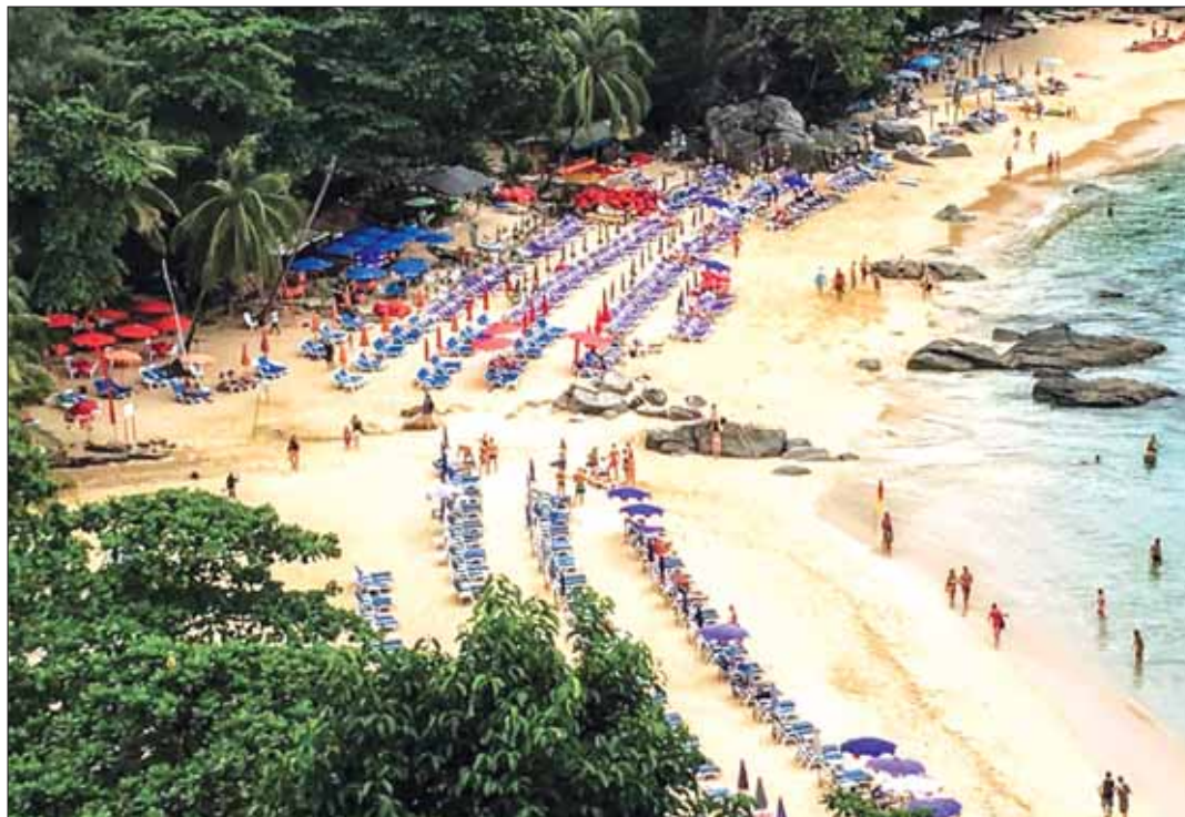
Though all umbrellas and beach chairs on Phuket's Laem Sing Beach are banned, photographs taken from above the beach show furniture obscuring much of the sand. Phuket Vice Governor Chokdee Amornwat, who is in charge of the island's beach management, vowed to take action against the violation of provincial rules next week. For the full story, visit PhuketGazette.net .