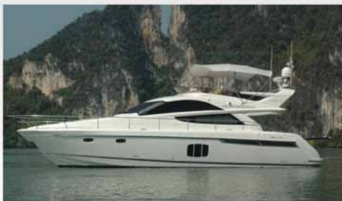
Fairline Phantom 48 (2011)