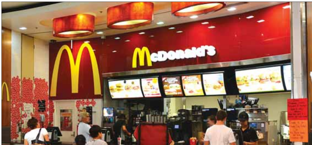
The Big Mac is meant to represent the price of a typical meal all over the world.

According to the index, the Baht is undervalued by just under 40 per cent. Keep in mind