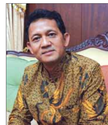
Governor Chamroen.

national city. We need to continue to come up with long-term strategies to meet the development needs of the island as it becomes a 'Smart City', he said. "We will soon be welcoming more than 16 million tourists a year to the island, and are also situating ourselves to be the maritime hub for the region."