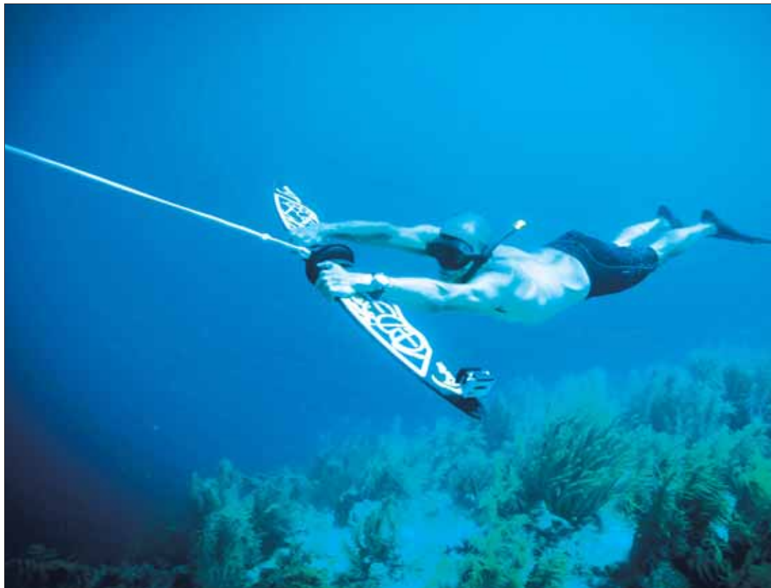
Check out some of the best and most exciting toys for when you're out on the sea.

kilograms, the Seabob can go overwater up to 20km/h and underwater at up to 15km/h, and with a number of power levels, they are a lot of fun for all with approximately 60 minutes ride time.