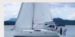
Beneteau Oceanis 54 (2013) 299,000 EUR