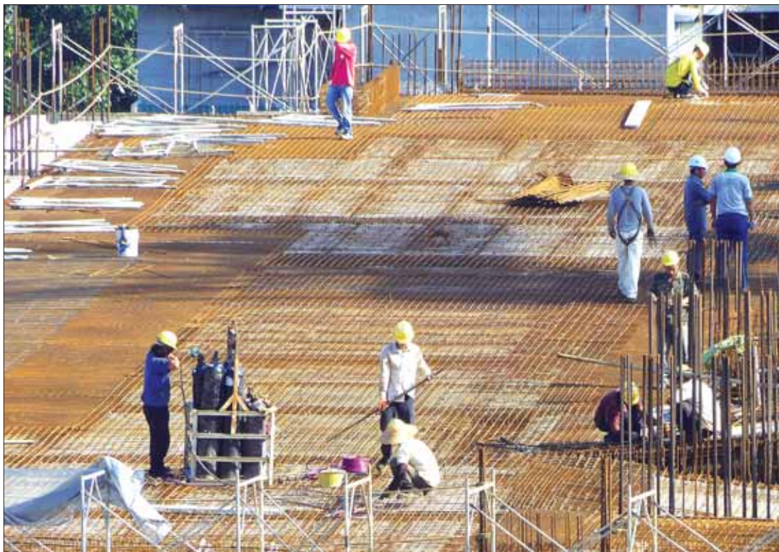
The island continues to witness growth in construction of new properties.

A significant difference from last year is the marked absence of Russian tourists and property buyers in the market. Due to the downfall of the Russian ruble and the ongoing war with Syria, even the traditional high season over Christmas and New Year has been quiet on the island. Looks like Putin got his wish in keeping nearly the entire Russian population home this winter instead of them basking on sunny beaches and ringing in the New Year in warmer countries. Property developers targeting Russian clients will no doubt have to change marketing strategies, or look for a totally new market,