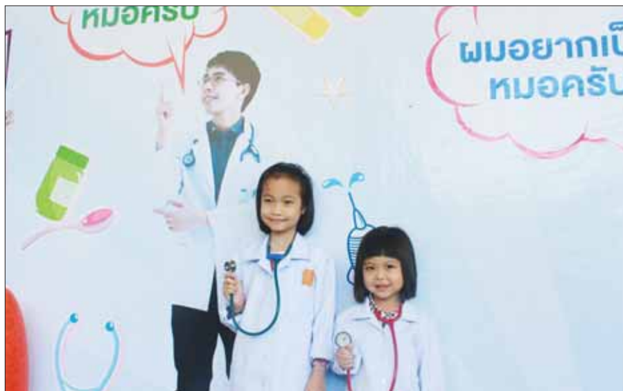
Children enjoy a day of fun, games and prizes at Phuket International Hospital.

Phuket International Hospital hosted a fun-filled event on January 9 entitled 'Fin & Fun Kids Day, I want to be a doctor'. More than 300 parents and children joined the event that was full of games, prizes and fun.