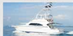
Bertram 510 (2002) 495,000 USD