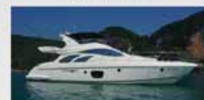
Azimut 55 (2008) 750,000 USD