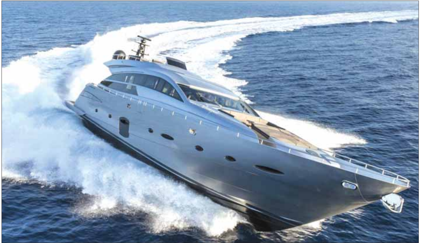
The Pershing 92 is just one of the many yachts that Lee Marine will be showcasing at the Thailand Yacht Show.

The prestigious Ao Po Grand Marina sets itself apart by having deep water access and a full breakwater, thus allowing access for mega yachts up to 100 meters at any time – an enviable location on Phuket's east coast.