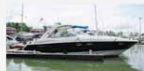
Monterey 415 Sport Yacht (2011) 320,000 USD