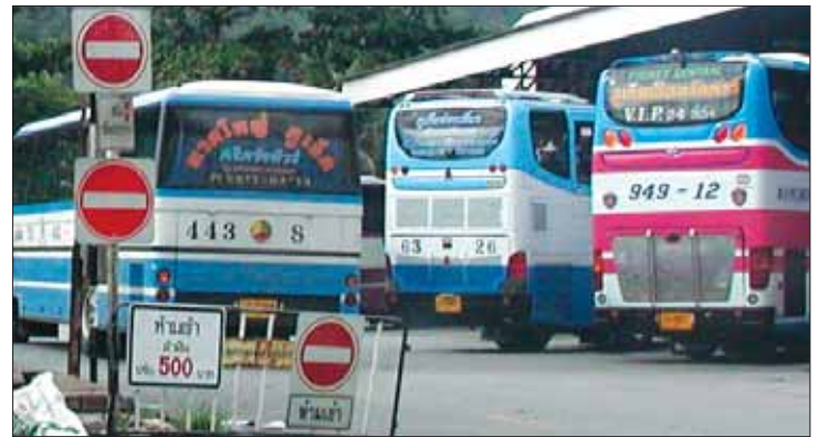
Tour buses have a real environmental impact.

The DDPM is responsible for everyone's safety and we take the job very seriously. However, at the end of the day, people need to help us help them by following the rules and regulations put in place for their own safety.