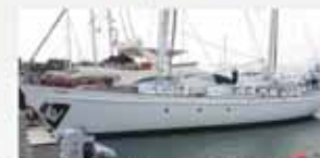
Palmer Johnson 84 (1968) 649,000 USD