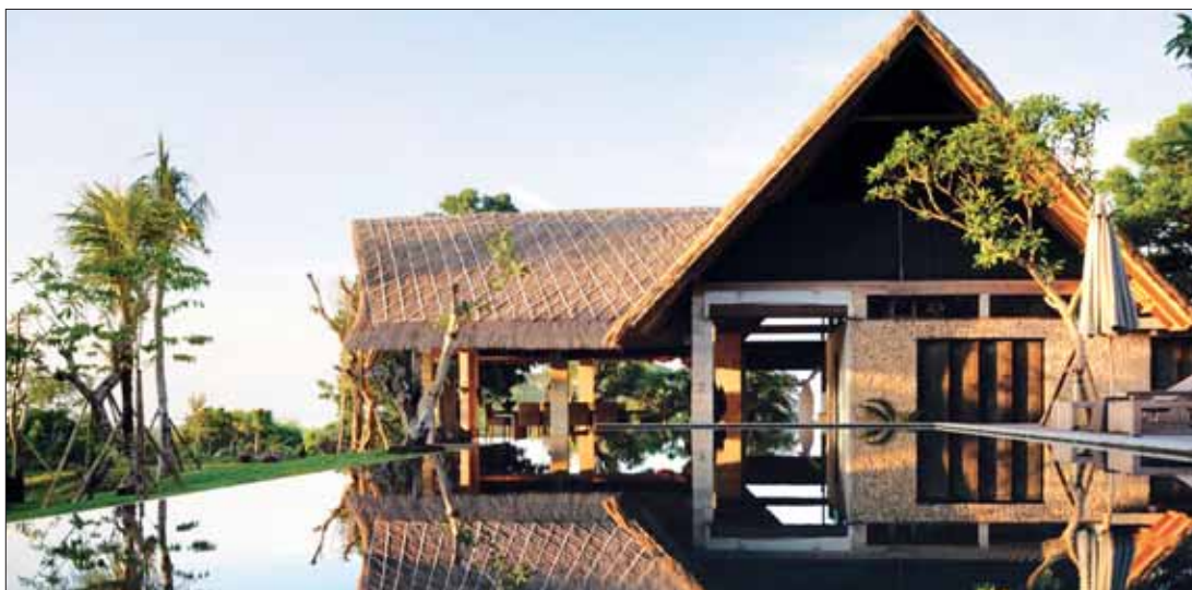
Luxury villa demand in Phuket has largely moved toward Asian markets.

Phuket has seen a dynamic shift in both tourism and villa rentals, which are now highly leveraged by the Asians, led by Hong Kong, Mainland China, and Singapore. These three are now the top geographic source markets for