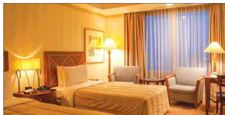
The company is aiming for 80-90 per cent occupancy.

beach club. We have villas, pool cabanas and suites. The pool's wavy structure along with the island bar is pleasurable for all that see it," he pointed out.