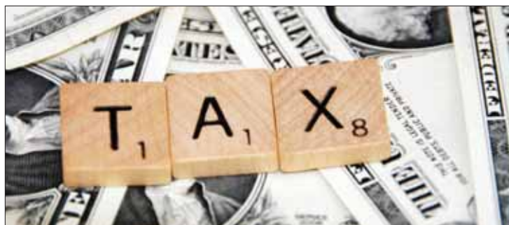
Five per cent inheritance tax will be levied on heirs.

PROPERTY, stocks, automobiles and cash are the four assets that will become subject to inheritance tax effective on February 1.