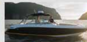
Cobalt 276 (2010) 2,200,000 THB