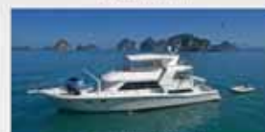
Symbol 57 (1990) 460,000 USD