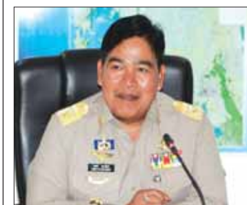
V/Gov Chokdee

OFFICIALS will soon require all foreign drivers to be in possession of an international driving licence when renting vehicles, confirmed Phuket Vice Governor Chokdee Amornwat on January 12.