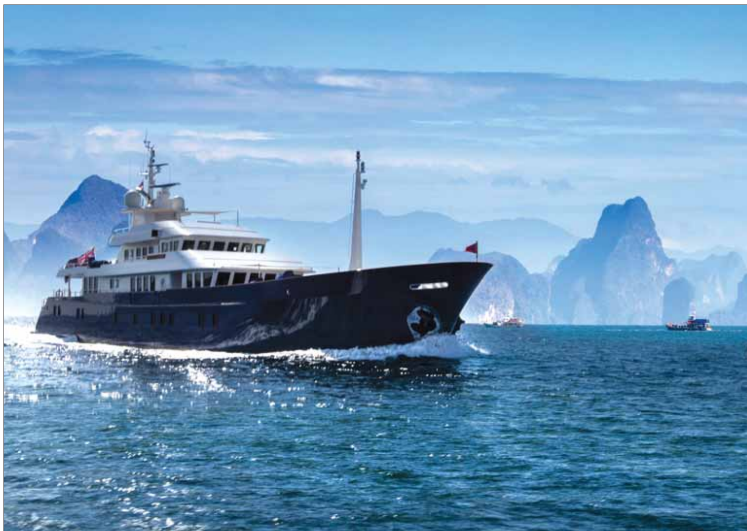
A number of superyachts are expected to join the event as Thailand openly embraces the superyacht chartering industry.

Completing Burgess Yachts' line-up will be the 32m M/Y Nanou , from Italian builder Benetti Yachts. A fantastic ac-