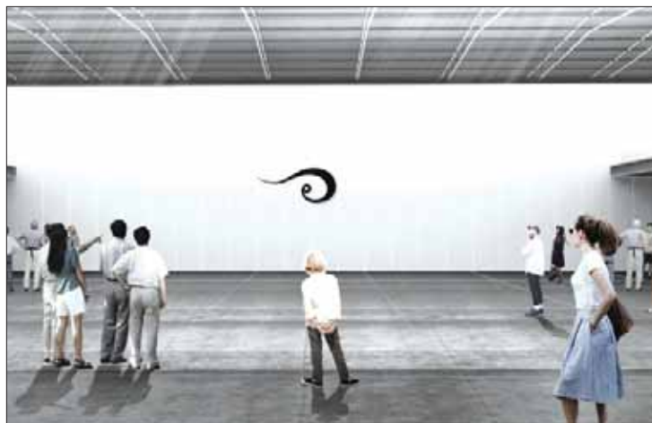
An artist's rendering of Mai Iam Art Museum.

THAI art will have a much bigger canvas this year as more museums, galleries and smaller spaces for 'alternative art' open across the Kingdom. Give thanks to the private sector, which is footing the bill for all the new venues.