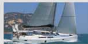
Hanse 445 (2012) 215,000 EURO