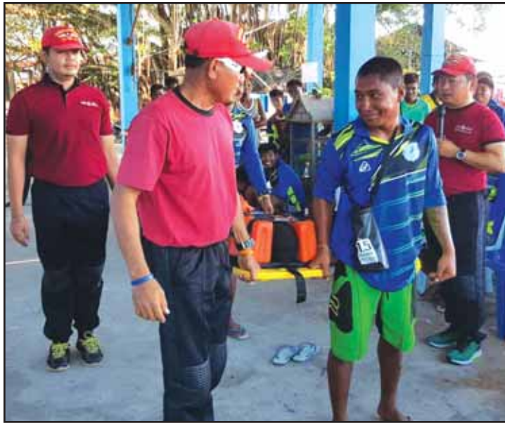
Boat crews were taught safety and rescue skills.