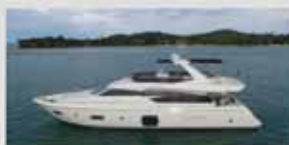
Ferretti 720 (2012) 2,250,000 EUR