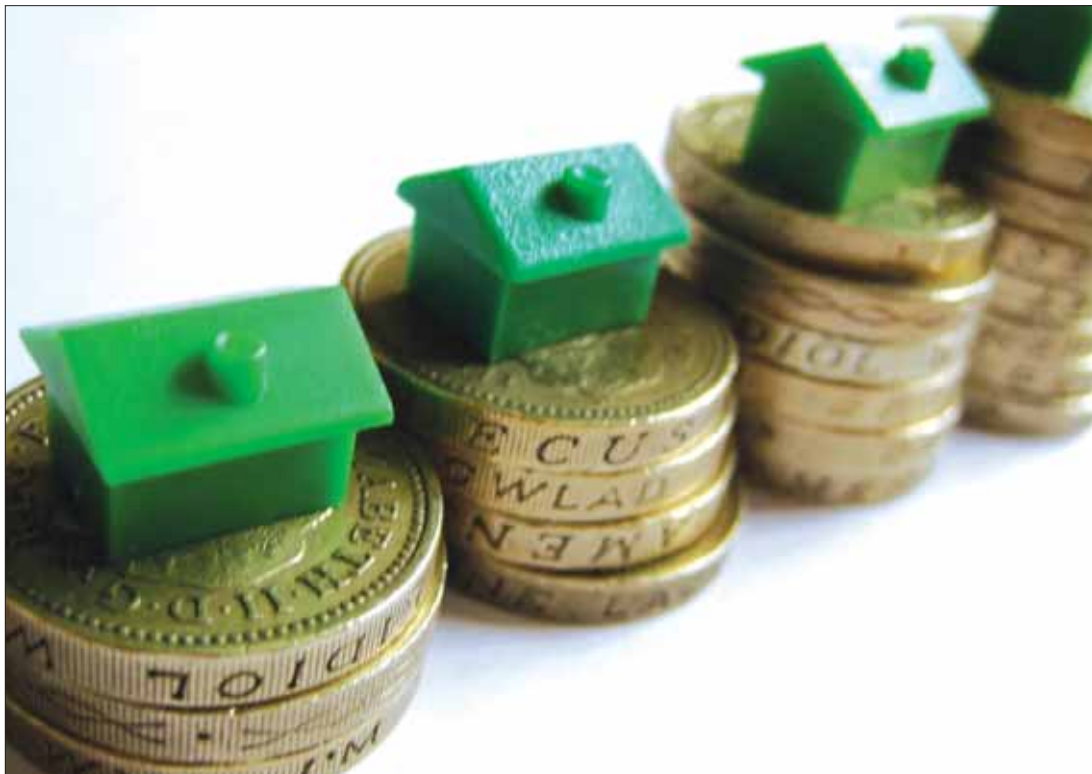
Consider your size needs before committing to buying residential property.

Realistically, once the parents are starting to retire, the adult children are so engrossed with building a career and starting a family, that it becomes