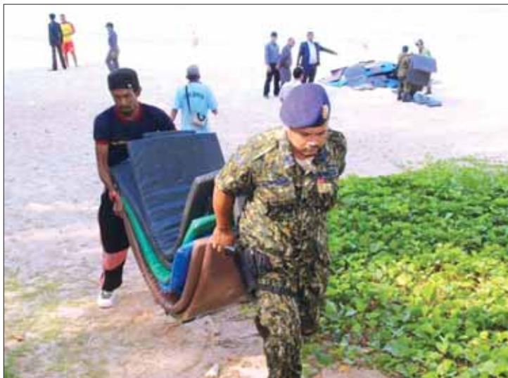
Illegal mats and umbrellas were seized.

The Gazette received a letter from an anonymous source who claimed to have filed a formal letter of complaint to the gover-