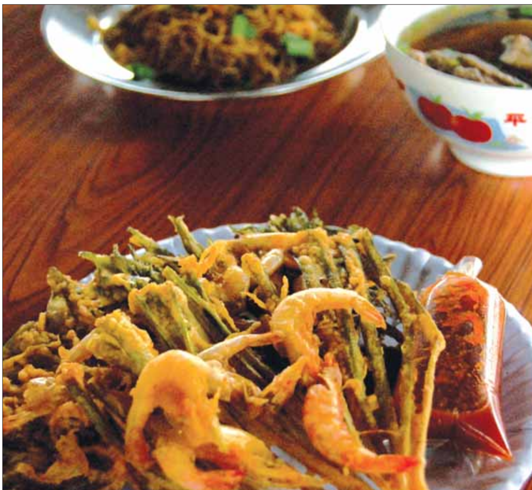
It's time to try what makes Phuket cuisine worthy of the title, so dig into some bue tord .

Among the dishes included in the application were the Baba recipes for moo hong (salted boiled pork), oh-aew (white jelly made from