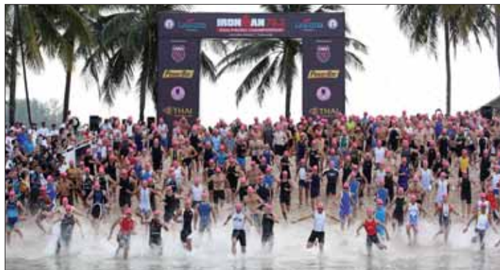
A US$15,000 prize and 30 age-group qualifying slots for the 2017 Ironman 70.3 World Championship will be offered.