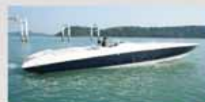
Nor-Tech 4300V (2001) 169,000 USD