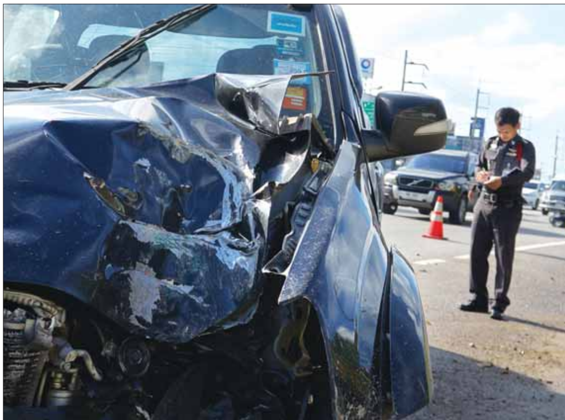
Phuket's international-quality hospitals are not cheap, so buy insurance.

Sadly the days of cheap international-standard hospitals in Phuket are gone, and the reports of hospital bills I get from many expats on the island are now scary enough to warrant serious consideration of insurance. I recently found out there is one insurer here that will write policies for expats as old as 70, which was a big surprise to say the least. Many simply assume it will be impossible to get insured as you approach this age, but FWD will in fact do it.