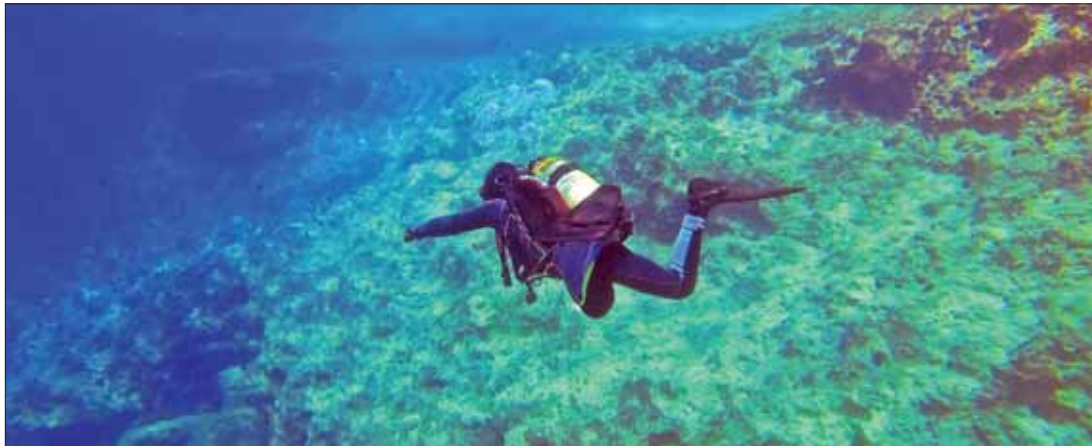
Serious attention is needed to limit the damage caused by destructive dive practices.

Thailand's marine safety record is not the best in the world. Boat accidents, fires, sinkings, tourist injuries and even death – these sorts of headlines have been seen regularly. That said, I believe there has been, for the first time in my nearly twenty years on this island, a genuine safety effort from the powers-