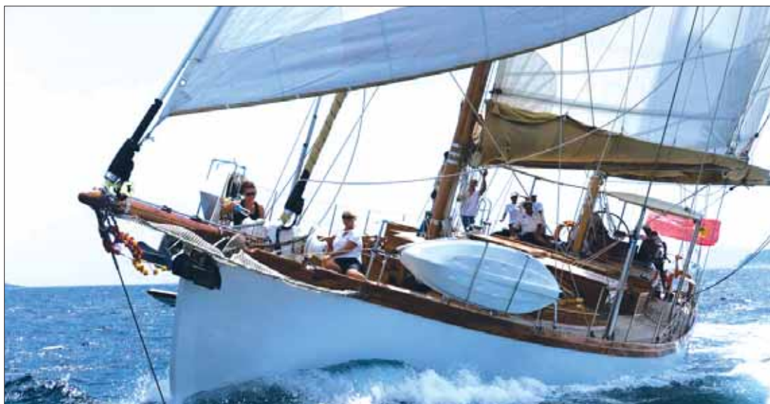
Guests were treated to sailing on a selection of yachts which were all 25 meters or longer.

whose owner was onboard, expressed sincere joy at his attendance and witnessing the sailing spectacle and festivities.