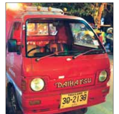
Tuk-tuks line the streets on either side of Soi Bangla.

Supap Pramkaew, head of the Karon tuk-tuk consortium, was against any modifications to the current design of tuk-tuks.