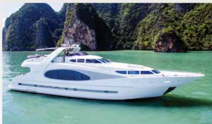
PR Marine 95 (1999)