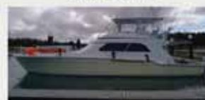
Bertram 60 Convertible (2011) 539,000 USD