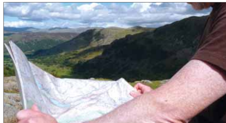
Phuket may become just another dot on a map.

We take responsibility for our tourists, workers and expats, and all we ask in return is that they take some responsibility for themselves and their loved ones, to keep Phi Phi a safe and respectable tourist destination for all to enjoy.