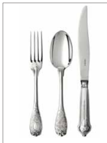
Packing silver.

Today, the House of Puiforcat, founded in the early part of the 19th century by a family of those silversmiths, has crossed the world and