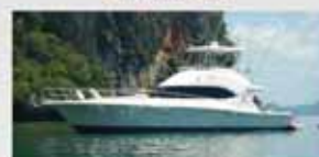
Riviera 42 Flybridge (2006) 10,900,000 THB