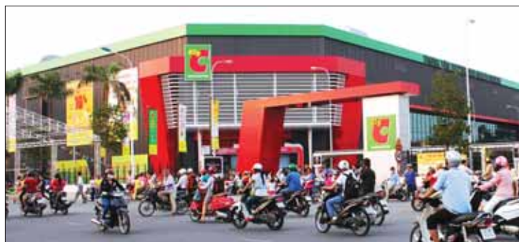
Big C owns about 800,000 sqm of leasable area.

FRANCE based Casino Group has decided to strengthen its financial flexibility with a deleveraging plan next year of more than 78 billion baht, mainly through real-estate transactions and the disposal of non-core assets.