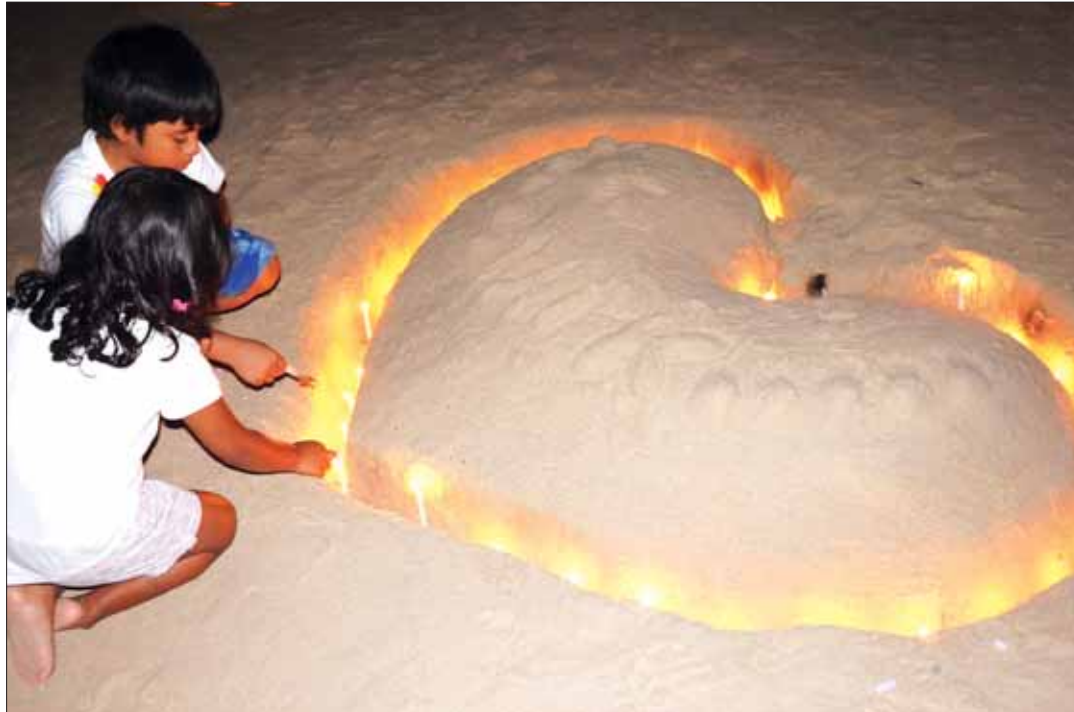
The world will be watching on December 26, as Thailand honors the victims of the Indian Ocean Tsunami, which devastated the region's coastline on December 26, 2004. Remembrance services will be held at the Tsunami Memorial Wall in Mai Khao, on Patong and Bang Tao beaches, as well as at Phuket Provincial Hall. For the full schedule of events, visit PhuketGazette.net.

permission and leaving the area designated for non-Thai citizens without permission.