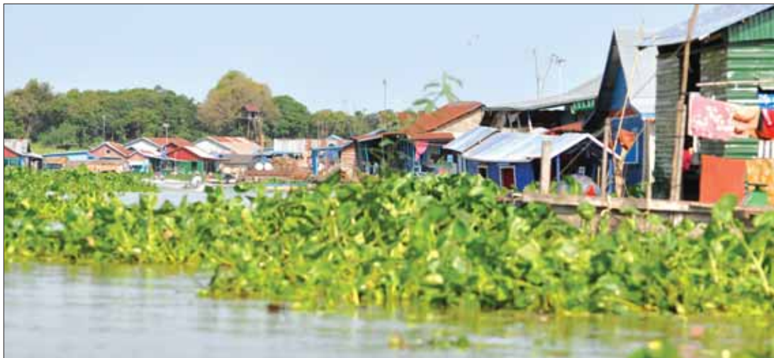
An American sheriff dumps out bootleg booze during the US prohibition era.

Mostly grass, black or silver carp from Asia, they are indiscriminate feeders, grow fast, adapt to conditions where there is little oxygen, can colonize almost any body of water and compete successfully with more desirable native fish.