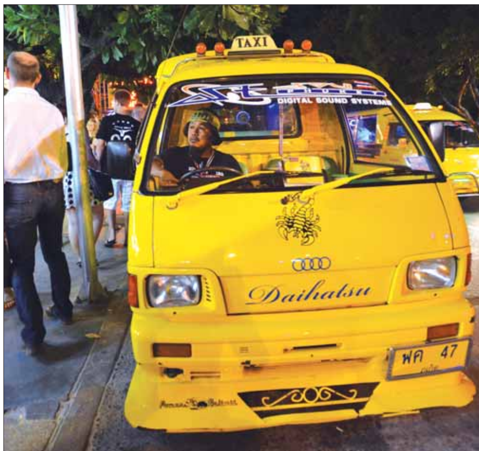
Tuk-tuk drivers say modifications, such as a gate or door, would be an inappropriate reaction to the tragic death of the 29-year-old British woman.

The driver said he was only going about 40km/hr as he ascended a hill between Patong and Kamala, when she fell. He was unsure what caused her to tumble out of