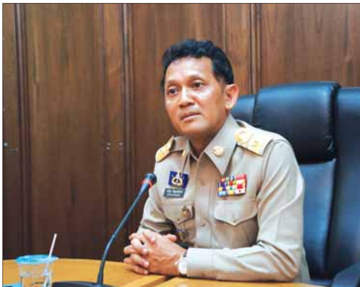
Phuket Gov Chamroen Tipayapongtada says he is ready to present the plan to Deputy PM Somkid Jatusripitak.

Governor Chamroen established four key points to be addressed: the location of the facility, to see if Mai Khao is still the most appropriate location; the design, to ensure appropri-