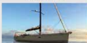
Bordeaux 60 (2011) 1,000,000 USD