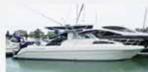
Silvercraft 34SC (2014) 4,750,000 THB

On sale brand new 2015 Sea-Doo RXP-X 260. 260hp/1,500cc + supercharge. Promotion on this New Year Festival. Price: 478,000 baht (normally 560,000 baht). Samutsakorn. Tel: 081-754 7599 (English & Thai), 092-269 6099 (Thai). Email: csutivas@gmail.com