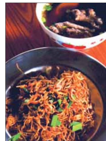
NOODLES: mee hokkien

The Creative Cities Network currently includes 116 members from 65 countries and covers seven creative fields: crafts and folk art, design, film,