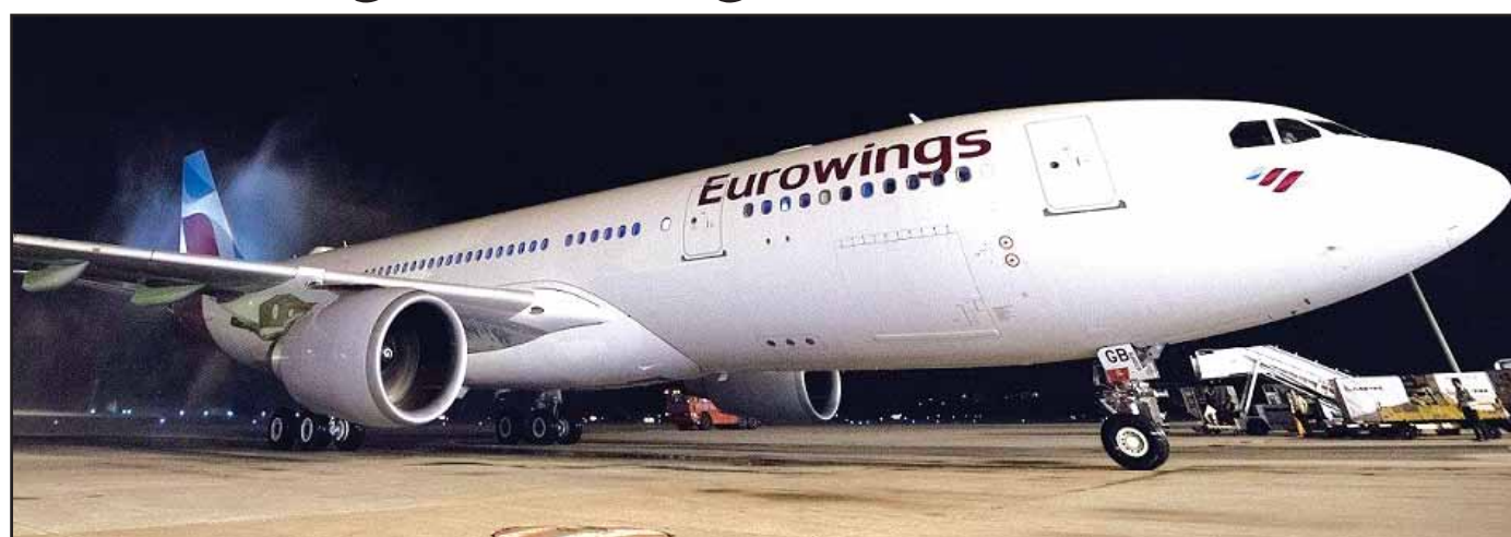
Phuket's first Eurowings flight lands at the airport, marking the company's move into the Southeast Asian market.

Southeast Asia in particular is becoming a true emerging market for low-cost airline business, since all nations in the region will become a single market under the Asean Economic Community from the beginning of next