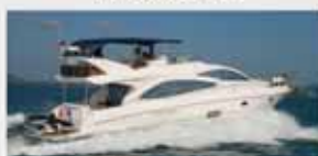
Majesty 56 (2011) USD$695,000