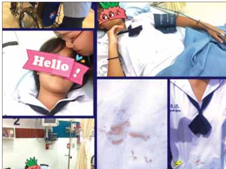
The girl's mother put the photos taken at the hospital on Facebook.

my daughter being bitten by a mosquito or an ant. Who are you to dare hit her so hard that