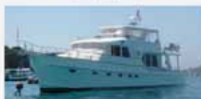
Grand Banks Aleutian 59 (2007) 1,250,000 USD