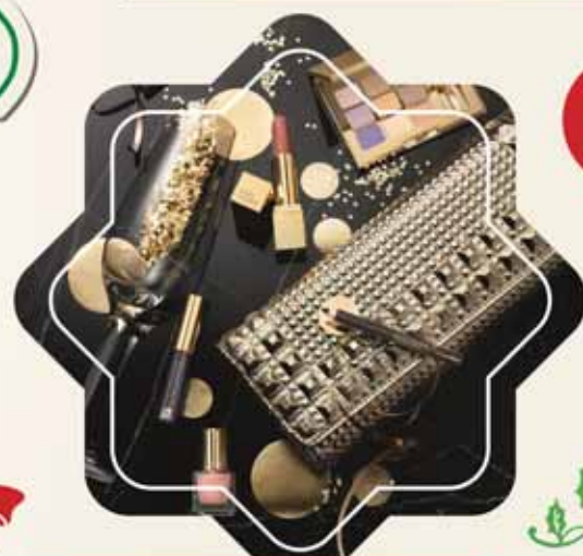
Estee Lauder HOLIDAY 2015 DECEMBER SET Central Festival Phuket 076-291 111 www.centralfestivalphuket.com