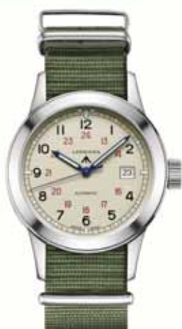
Longines Heritage Military COSD Central Festival Phuket 076-291 111 www.centralfestivalphuket.com