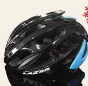
Lazer blade helmet It's my bike shop 087-274 2727 https://www.facebook.com/MY-BIKE