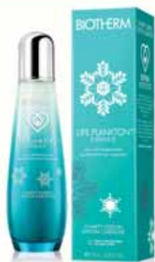
Biotherm Life Plankton Essence Limited Edition Central Festival Phuket 076-291 111 www.centralfestivalphuket.com