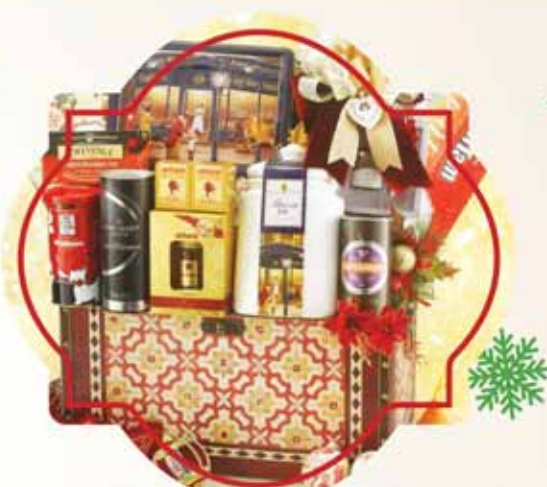
The Ultimate Supremacy 02-660 1000 www.tops.co.th/topsshoponline