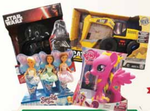
TOYS Central Festival Phuket 076-291 111 www.centralfestivalphuket.com