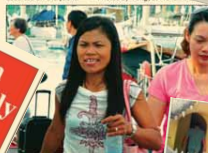
PHUKET: Beach locations in Phuket, Phang Nga and Krabi have been chosen for the holding of official tsunami anniversary commemoration ceremonies on the morning of December 26.