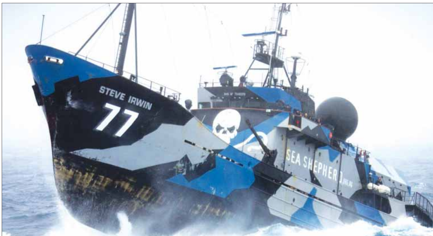
Capt Siddharth Chakravarty will be leading a team on the Steve Irwin to hunt down two ships wanted by Interpol.

All hands on deck as Sea Shepherd begins search for Interpol-wanted boat