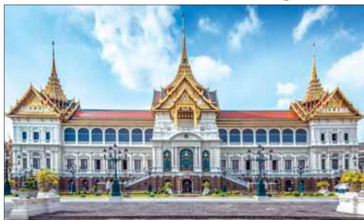
The 28 th Standard Chartered marathon will start and finish in front of the Royal Grand Palace, Bangkok.

THE 28 th Standard Chartered Marathon will take place on November 15 in Bangkok. This is one of the biggest marathons in Thailand.