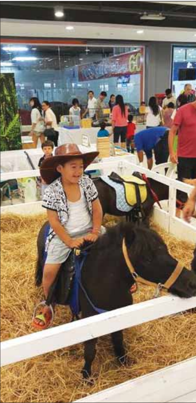
A child rides a Shetland pony.