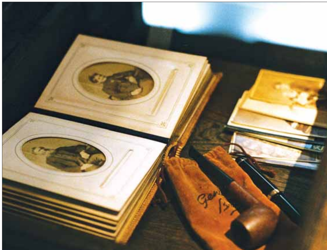
The memoir is a treasure trove of unearthed family memorabilia.

"I will confess that in the interest of narrative I secretly hoped that I'd find a payload of southern gothic: deceit and scandal, alcoholism, domestic abuse, car crashes, bogeymen, clandestine affairs, dearly loved and disputed family land, aban-