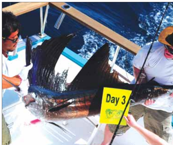
Besides fishing, PIST is very much geared toward fundraising, coming up with 175,000 baht last year for children's charities.