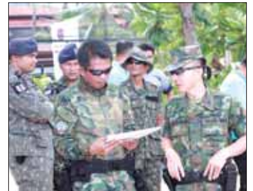
Navy officers oversee the beach management plan.

PATONG Beach has become the first beach on the island to have the official 10 per cent zone implemented, confirmed Phuket Vice Governor Chokdee Amornwat on November 6. Large markers were placed at the corners of the zones.