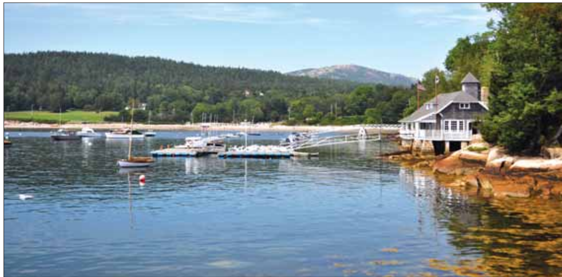
Living the dream: multi-million baht cost of tranquility.

Those that value solitude, peace and tranquility now have very limited options in Phuket; multi-million baht villas by the sea, for one. The cost of tranquility is extremely high. Economically, it would seem obvious that if the reason for buying an exclusive villa is privacy and peace, you could simply build one somewhere past Sarasin bridge in Phang Nga Province and pay substantially less for it than in Phuket. However, the truth is that the attraction of Phuket is not really solitude, peace and tranquility.