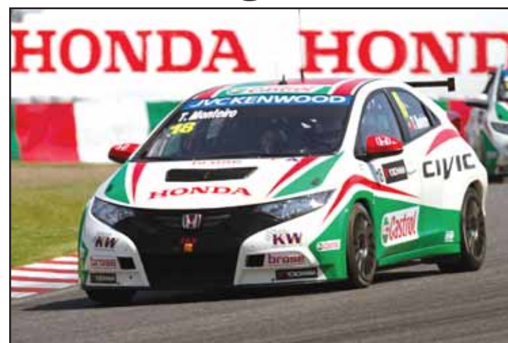
Honda is investing 1.7bn baht in the test course.

The new test course will be built on a site of more than 800,000 square meters with various test tracks.