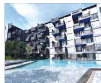
Only 30 per cent of the property is still available.

The Deck, with a development value of 1.4 billion baht, was designed to meet the needs of niche buyers looking for investment and rental potential in