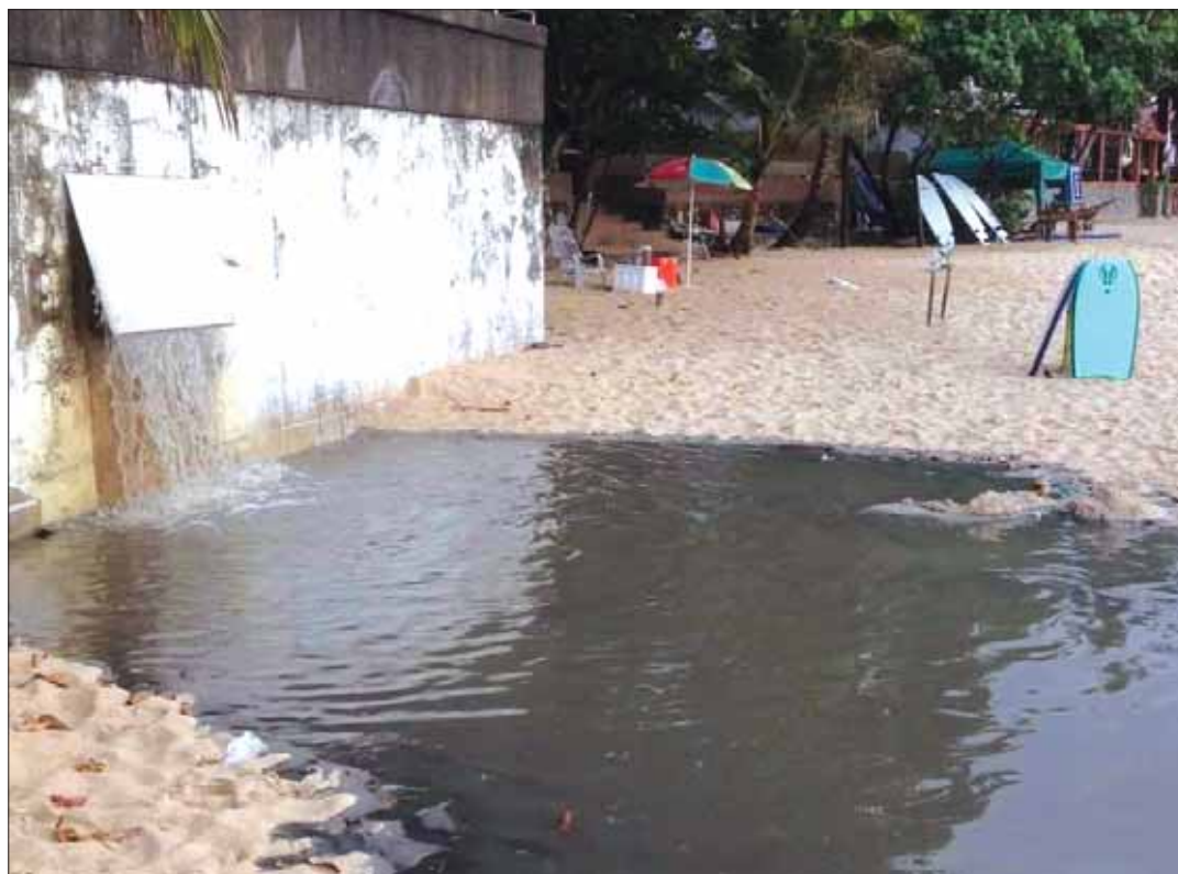
The foul black water that flowed across Karon Beach on October 5 was not connected to any hotel improperly discharging untreated wastewater, confirmed officials. Karon Municipality's Engineering Division emptied a wastewater container abreast the beach before shutting off the pump to work on a broken pipe. However, sudden heavy rain caused the container to overflow onto the beach. For the full story visit PhuketGazette.net .

him near Phuket International Airport on November 9.