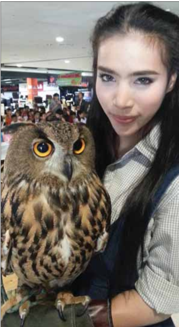
A guest holds a Eurasian Eagle-owl, one of the largest species of owls.