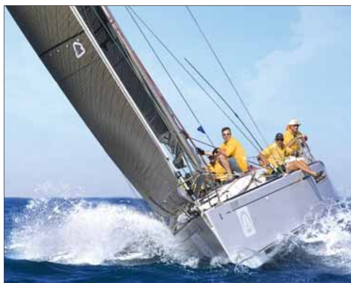
Sailors out to race at the regatta.

As well as bringing some of the world's fastest independent racing teams, the Phuket King's Cup Regatta is famed for its beachside party series. Revelry and camaraderie to the backdrop of fireworks and live music form a big part of the attraction for competitors, as