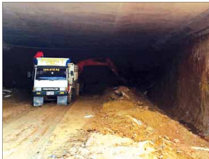
The contract for the project was extended three times. However, it is still only 54 per cent finished.

Nonetheless, the government must grant Wiwat Construction Co Ltd further time until the end of January