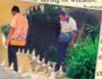
PHUKET: The laying of wreaths...