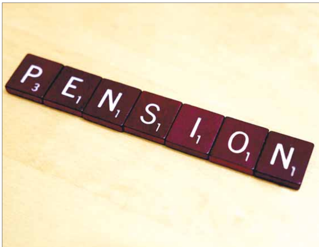
'Pension' isn't worth much in Scrabble, but the real deal can make all the difference.

If you have a government sponsored pension, it becomes more complicated as to what your options are. The UK "pension freedoms" were really a tax grab in disguise. However, if you have a small pension this