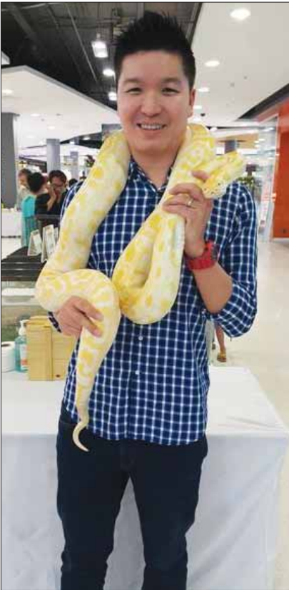
A guest holds a yellow Burmese Python.

Homeworks Phuket hosted the Exotic Animals Show 2015 from October 30 through November 8. Guests were able to meet a variety of animals in the show as well as enjoy performances. The event also displayed many animal food supply and accessory booths.