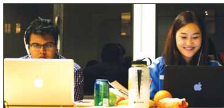
Facebook proved to be invaluable while moving.

I am very happy and excited about the new ban, as it will not only help Phuket's image, but will help all concerned offices to work more efficiently.