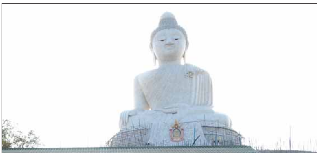
The Big Buddha image atop the Nakkerd Hills reaches an astonishing 45 metres in height.

This auspicious day was that of the full moon and so I anticipated seeing Buddha, sun