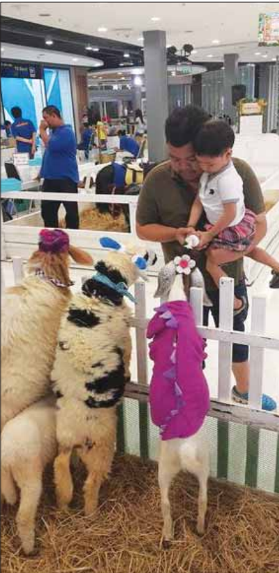
A child feeds milk to sheep and goats.