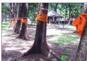
The trees locals have saved.