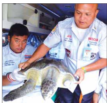
The injured turtle had gold leaflets on its belly.

"The turtle was probably injured while stuck in a fishing net and may have been brought ashore to be raised as a pet to make merit, as it has many gold leaflets that you would find at a temple on its belly."