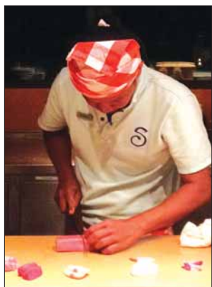
Baba Iki gives air of a fancier hibachi-style restaurant.