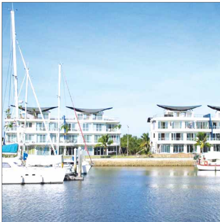
A beach club and new condo building coming up at Krabi Boat Lagoon.

Buyers also have an option of entering a rental pool, although no guaranteed return is offered. It is noteworthy that