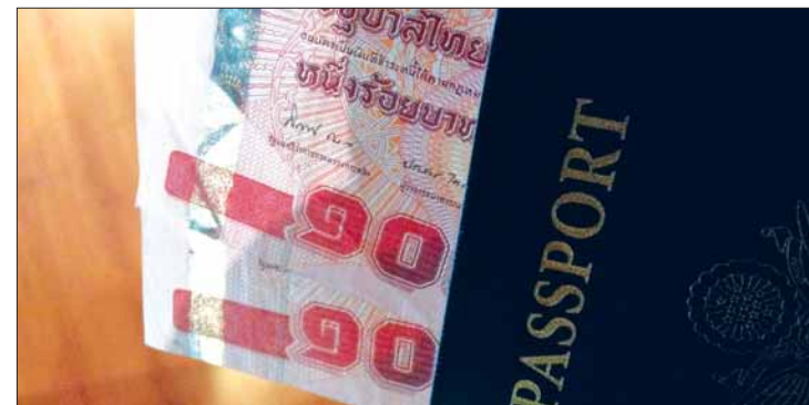
Alleged bribes given at the border cause some to feel morally conflicted.