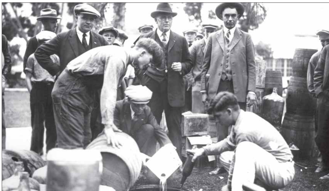
An American sheriff dumps out bootleg booze during the US prohibition era.

suffer. Bars in cities such as Chiang Mai, already affected by a ban, have begun to hide alcohol and serve patrons in secret. Some bar owners insist they will have to close up shop. Payoffs to police, already a problem for many bars, are likely to increase.