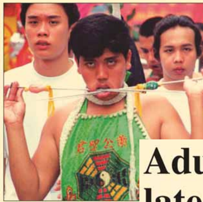
This piercing by a devotee is very restrained