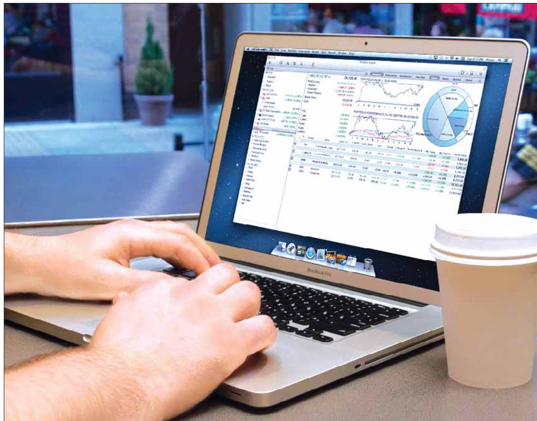
It is more important to be in the right kind of investments, as determined by where we are in the longer term business cycle.

At the moment, my favorite asset classes are cash and money market funds, short duration bond funds and trend-following futures funds. I may sound like a broken record, but having a