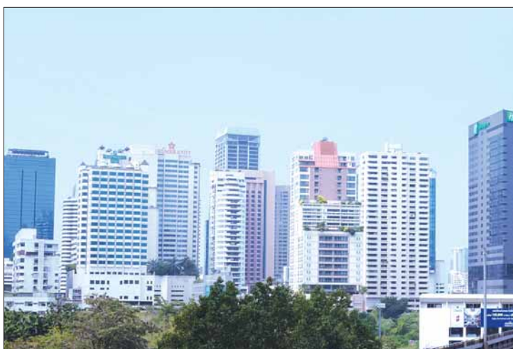
Bangkok condominium launches will likely dip in the second half.

He said that in the first half of this year, total sales value of residential projects in