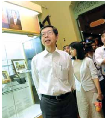
Governor Prasarn Trairatvorakul.

THE outgoing Bank of Thailand (BOT) governor said in an exclusive interview with the Nation Group that the ongoing political situation, Thailand's economic potential and 'boiling-up issues' were his three main concerns as his five-year term came to an end on September 30.