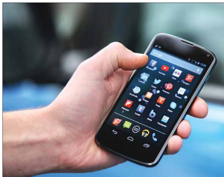
Improving only one or two per cent at each process point could lead to a massive increase in profitability.

If you do it right, I bet you can make a huge difference to your business. I will even bet you 100 per cent I am right! So