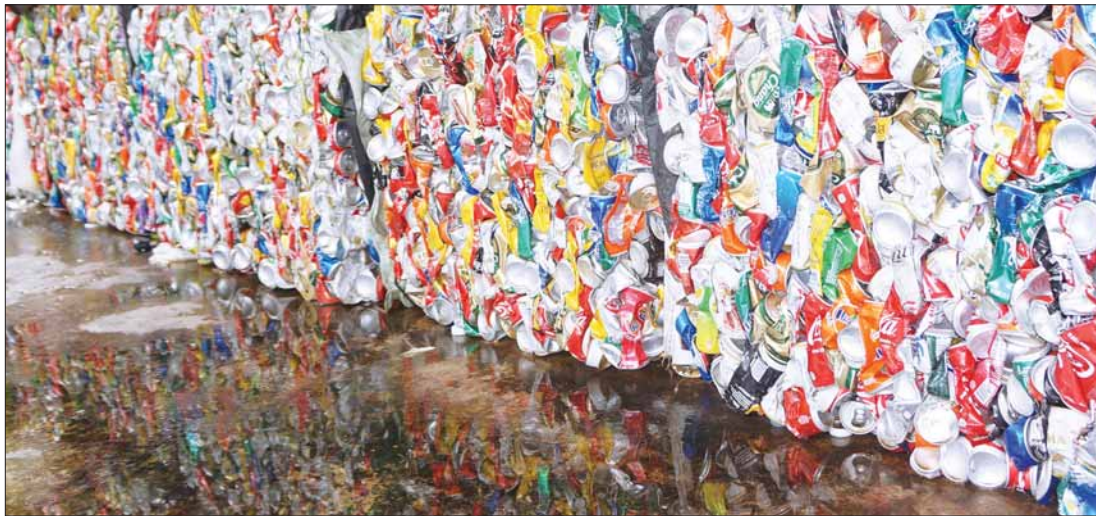
Cans are crushed into squares before being shipped sold to factors as raw material.

In May this year, it was reconfirmed that the two operational incinerators at the Saphan Hin landfill – a third one has been offline since 2012 – have a total burning capacity