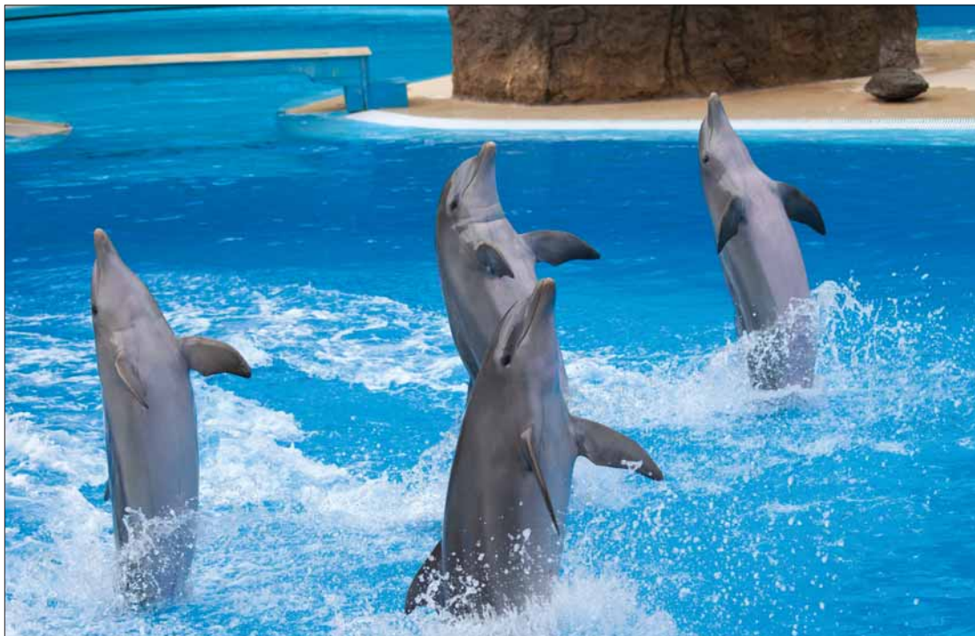
The Nemo Dolphinarium has yet to announce what marine animals it will import.

The dolphinarium is slated to open for the upcoming high season in November. However, the company is prepared for it to take a little longer – perhaps not opening until December.