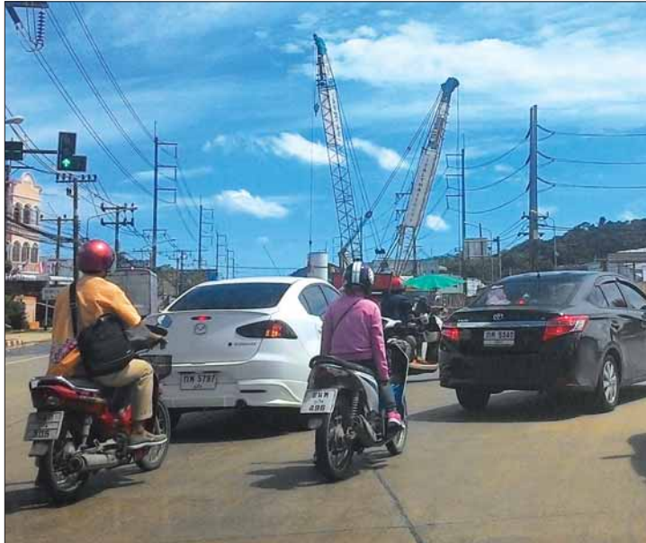
Motorist wait to turn at the Bang Khu underpass construction site.

The test will take place over several days, after which officials will decide whether or not