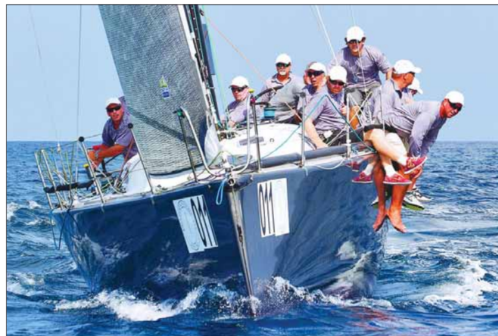
Captains: Prepare your boats and crew.

THE island is readying its sails for the King's Cup Regatta 2015, which will take place off of Kata Bay from December 5 to December 12.