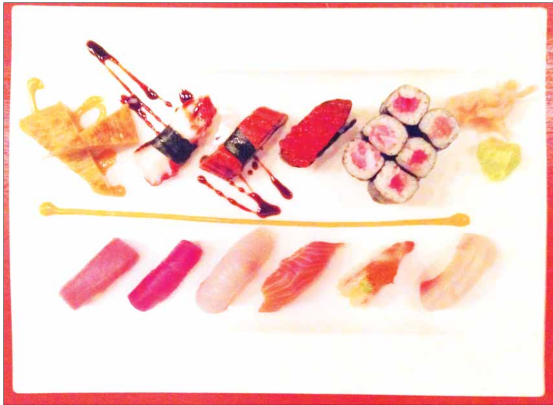
The food is so beautiful that you will need to admire it before devouring.

look at, with the perfected art of simple elegance throughout the menu. When the food is presented to you, it is something to admire before jumping in and devouring it.